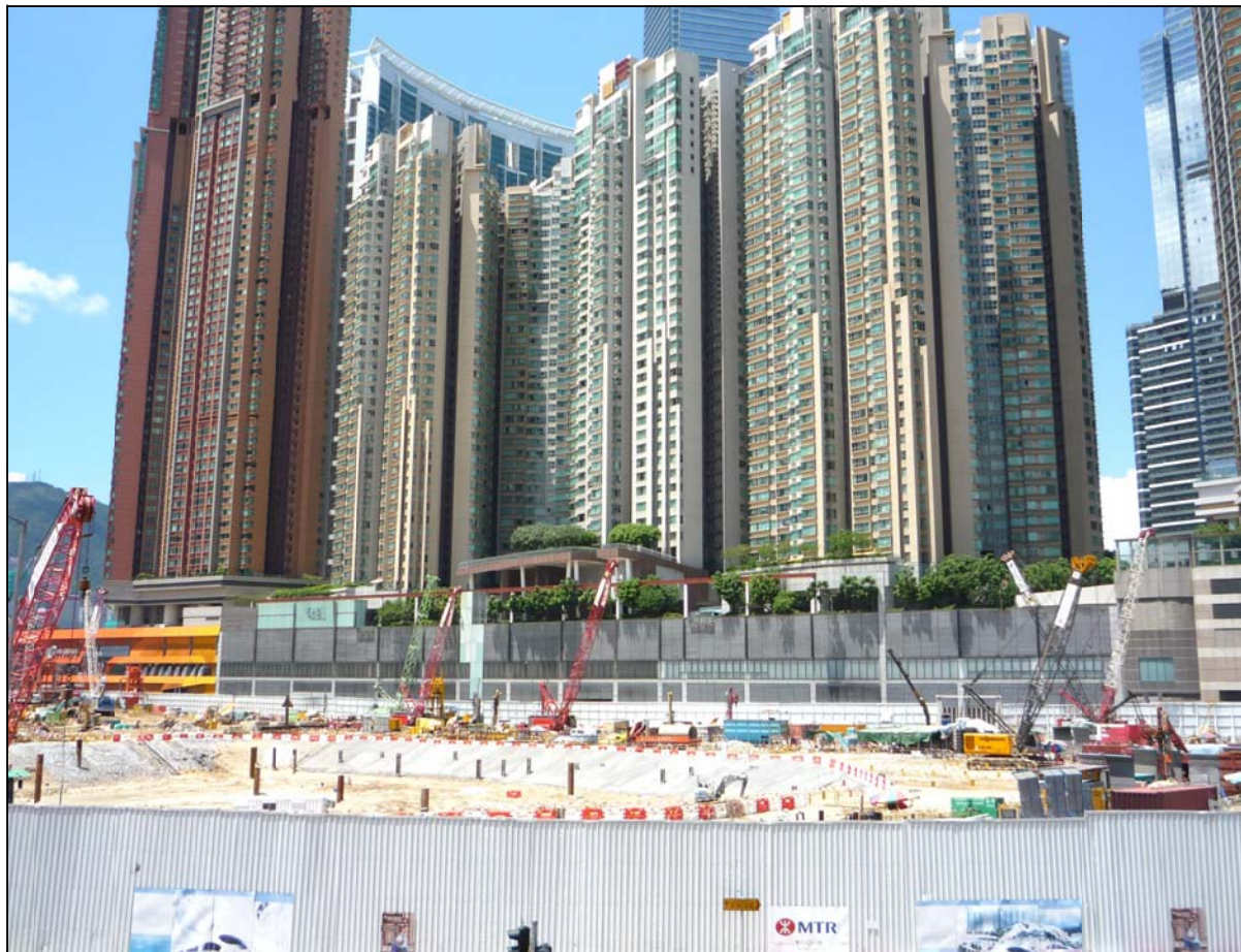
Photo VC20 (LCA10) Guangzhou-Shenzhen-Hong Kong Express Rail Link Terminus Construction Site & Austin Station