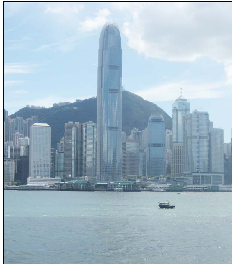
LR3.1 Victoria Harbour Photo 1