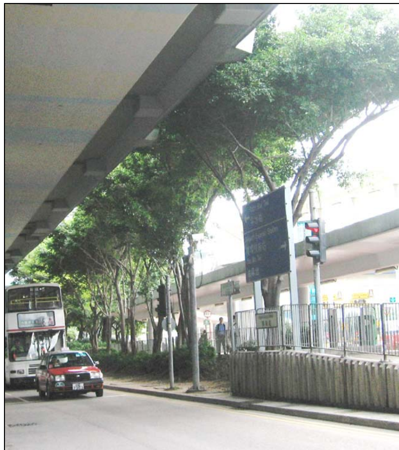
LR2.28 Roadside Plantation along Western Harbour Crossing Bus Stop near Element Photo 1