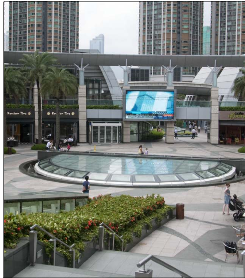
LR2.27 Amenity Planting within the private development at the Kowloon Station Photo 2