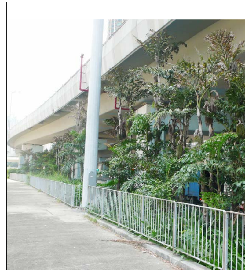
LR2.28 Roadside Plantation along Western Harbour Crossing Bus Stop near Element Photo 3