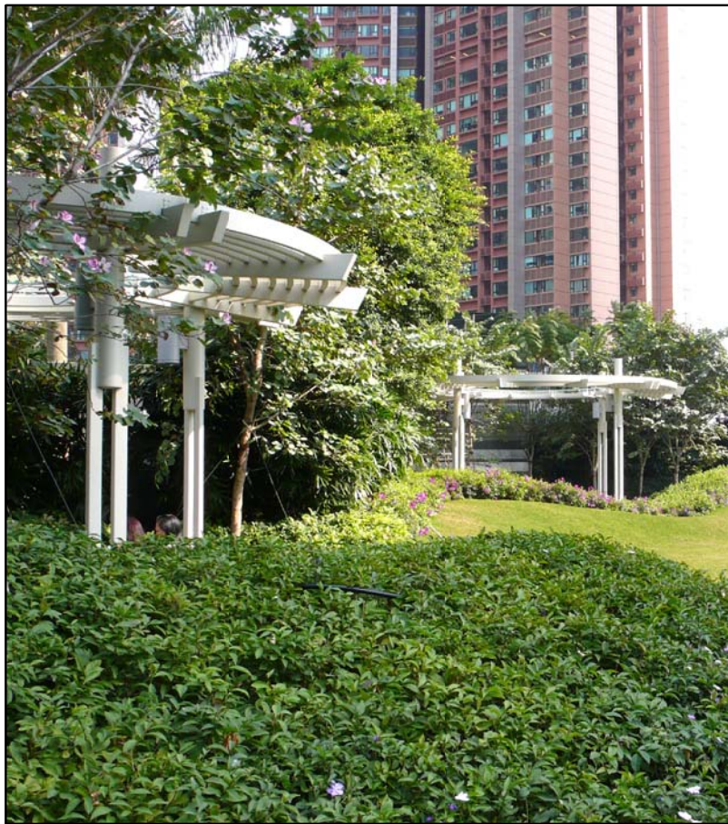
LR2.27 Amenity Planting within the private development at the Kowloon Station Photo 1