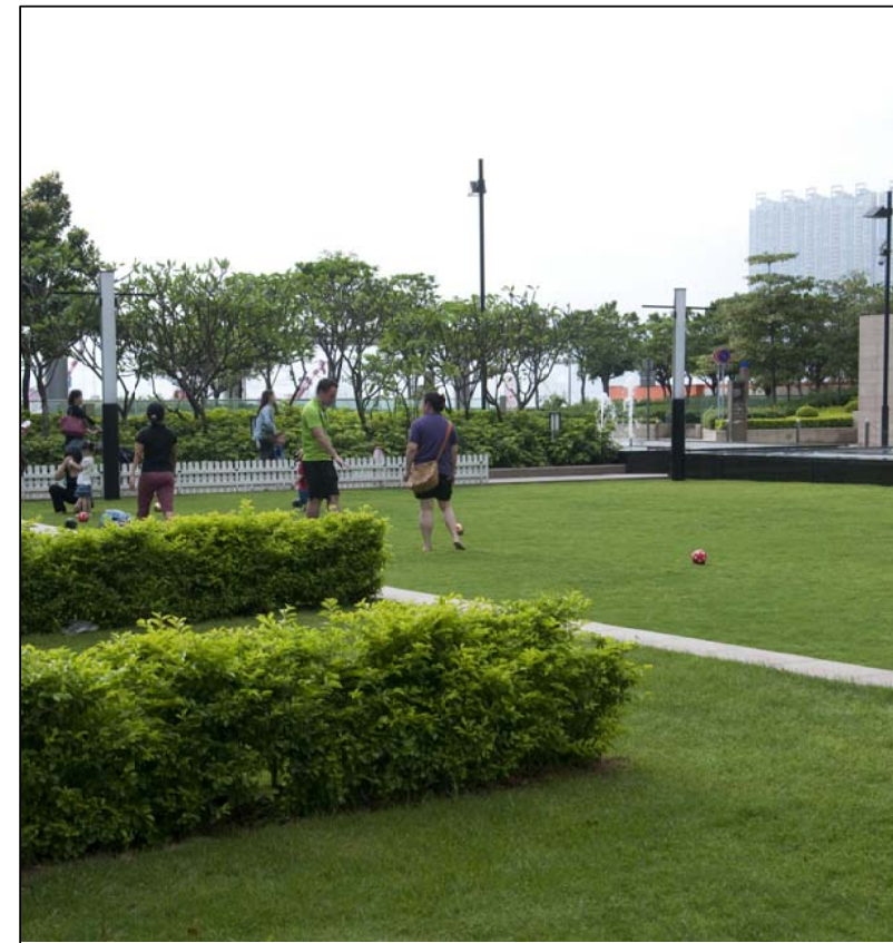
LR2.27 Amenity Planting within the private development at the Kowloon Station Photo 3