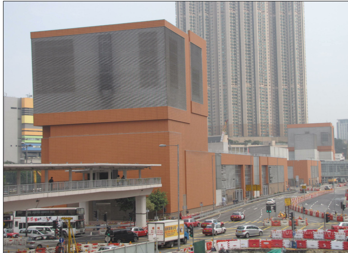
VSR 7 Austin Station