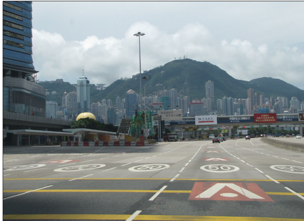
VSR 9 Travellers Arriving Western Harbour Crossing Toll Plaza