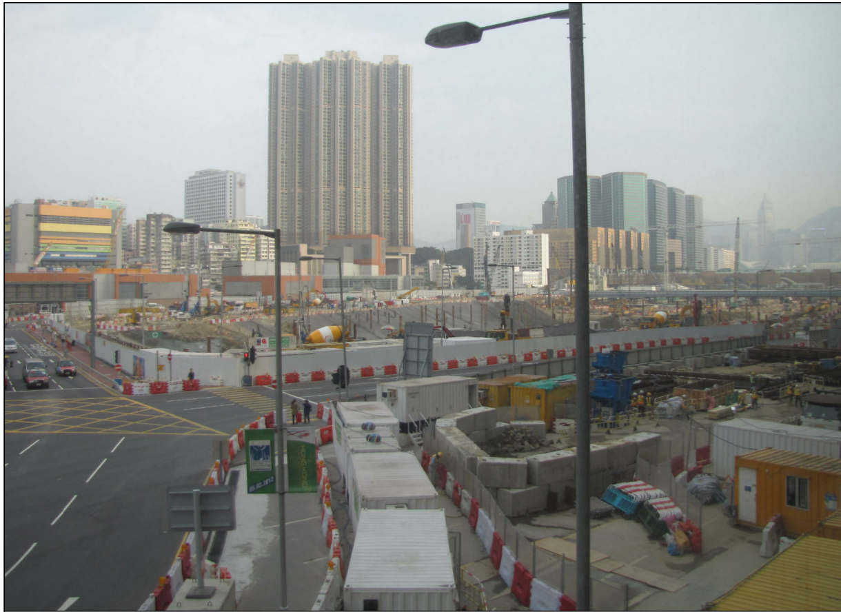
VSR 5 West Kowloon Terminus & VSR 6 Planned CDA Development above West Kowloon Terminus