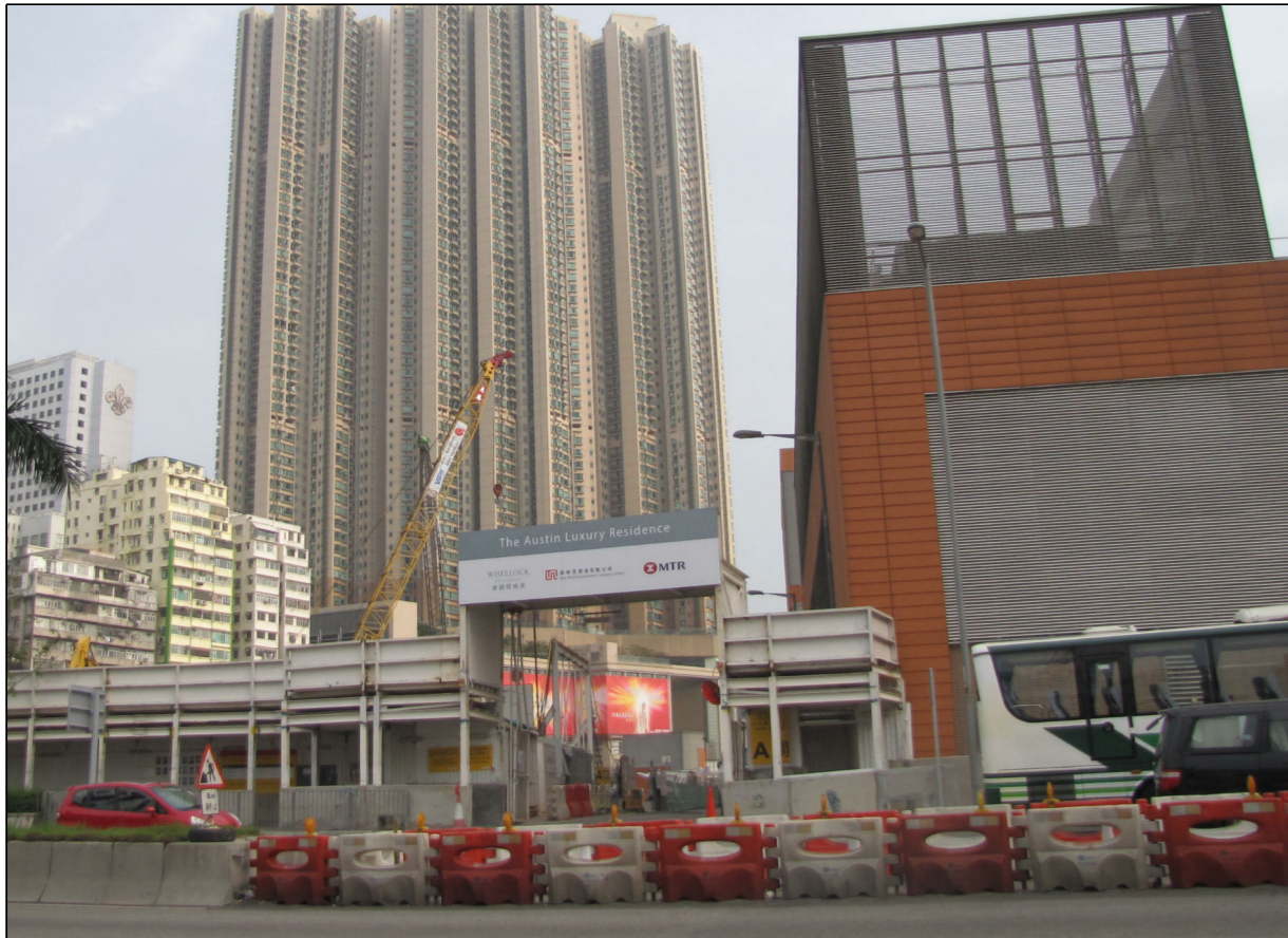
VSR 8 Planned Residential Development above Austin Station