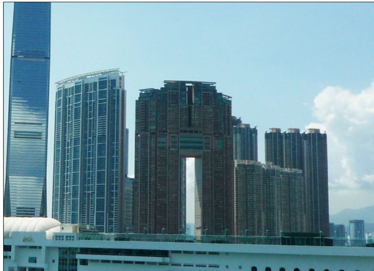
VSR 4 The Arch