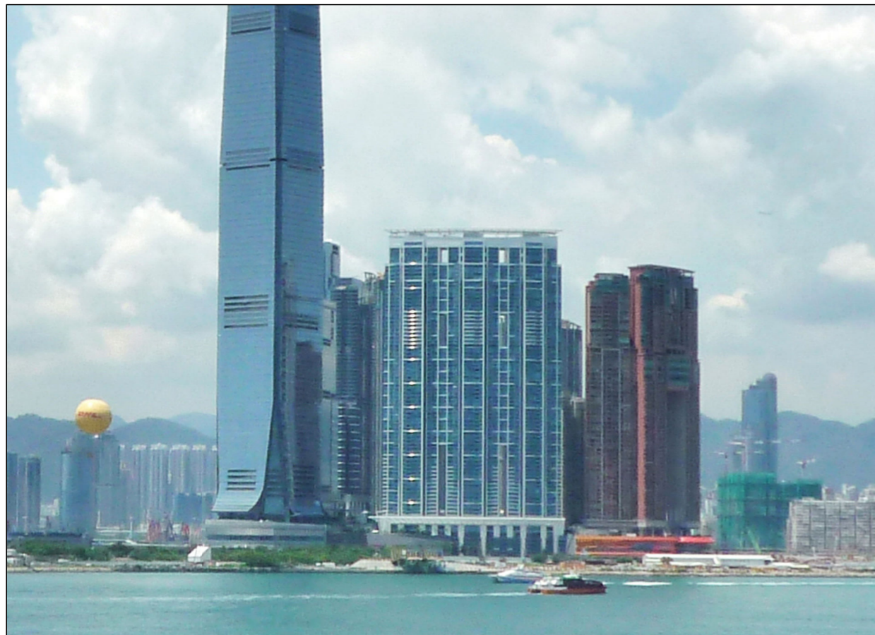
VSR 3 The Harbourside