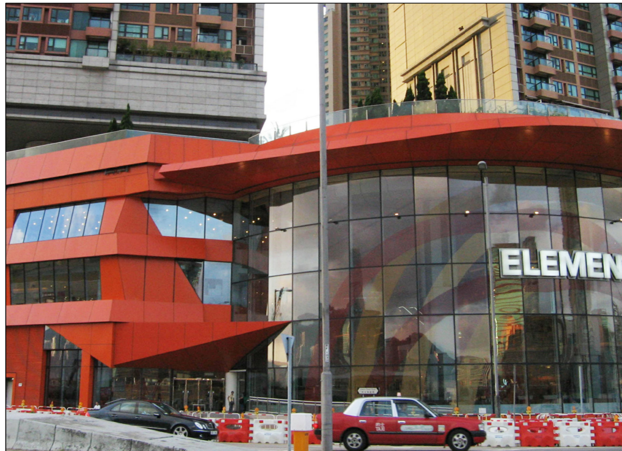
VSR 2 The Elements