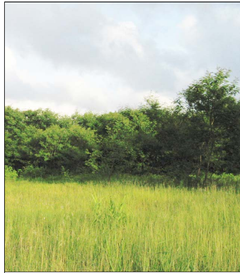
LR2.36 Tree Cluster in the Eastern Part within the Site Boundary Photo 1