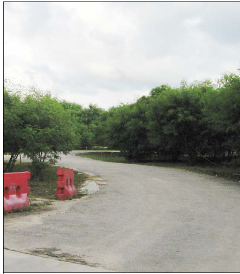
LR2.35 Tree Cluster in the Western Part within the Site Boundary Photo 2