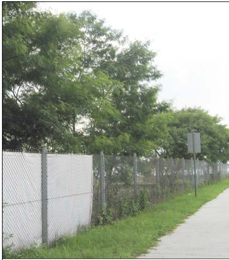
LR2.35 Tree Cluster in the Western Part within the Site Boundary Photo 1