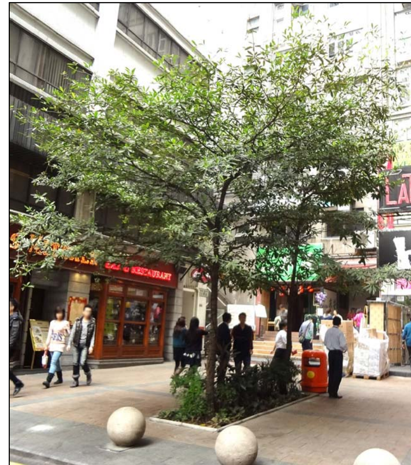
LR2.37 Amenity Planting at the end of Ashley Road Photo 1