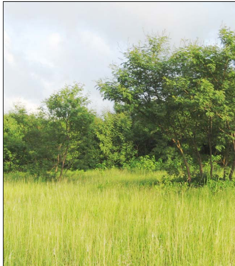
LR2.36 Tree Cluster in the Eastern Part within the Site Boundary Photo 2