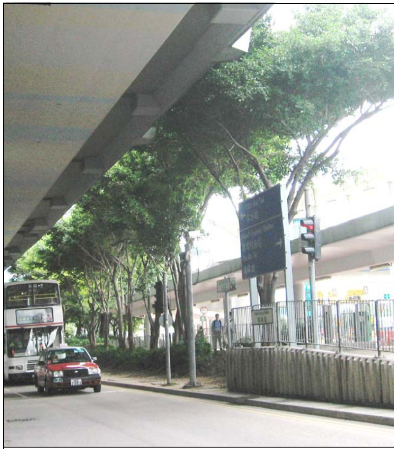
LR2.28 Roadside Plantation along Western Harbour Crossing Bus Stop near Element Photo 1