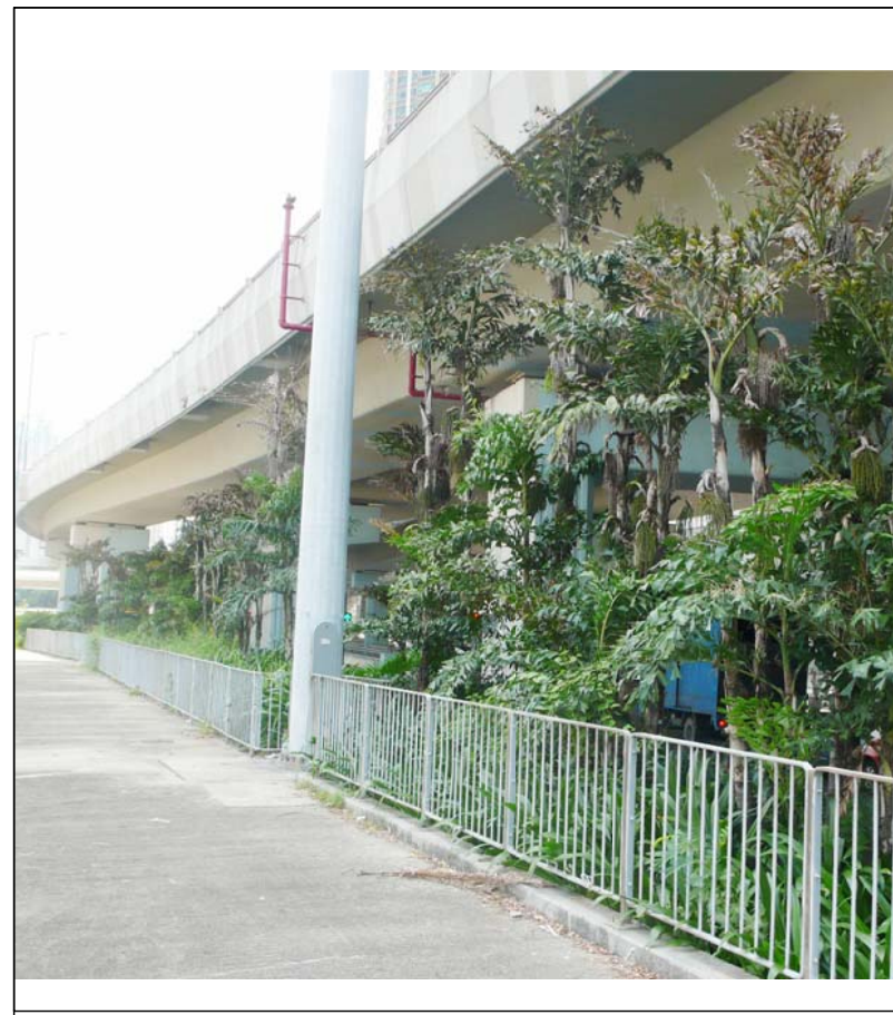
LR2.28 Roadside Plantation along Western Harbour Crossing Bus Stop near Element Photo 3