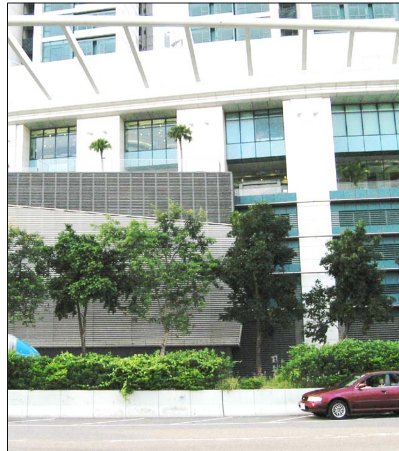
LR2.29 Roadside Plantation along Austin Road West Photo 3