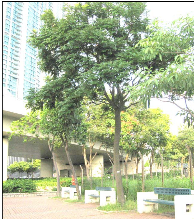
LR2.29 Roadside Plantation along Austin Road West Photo 1