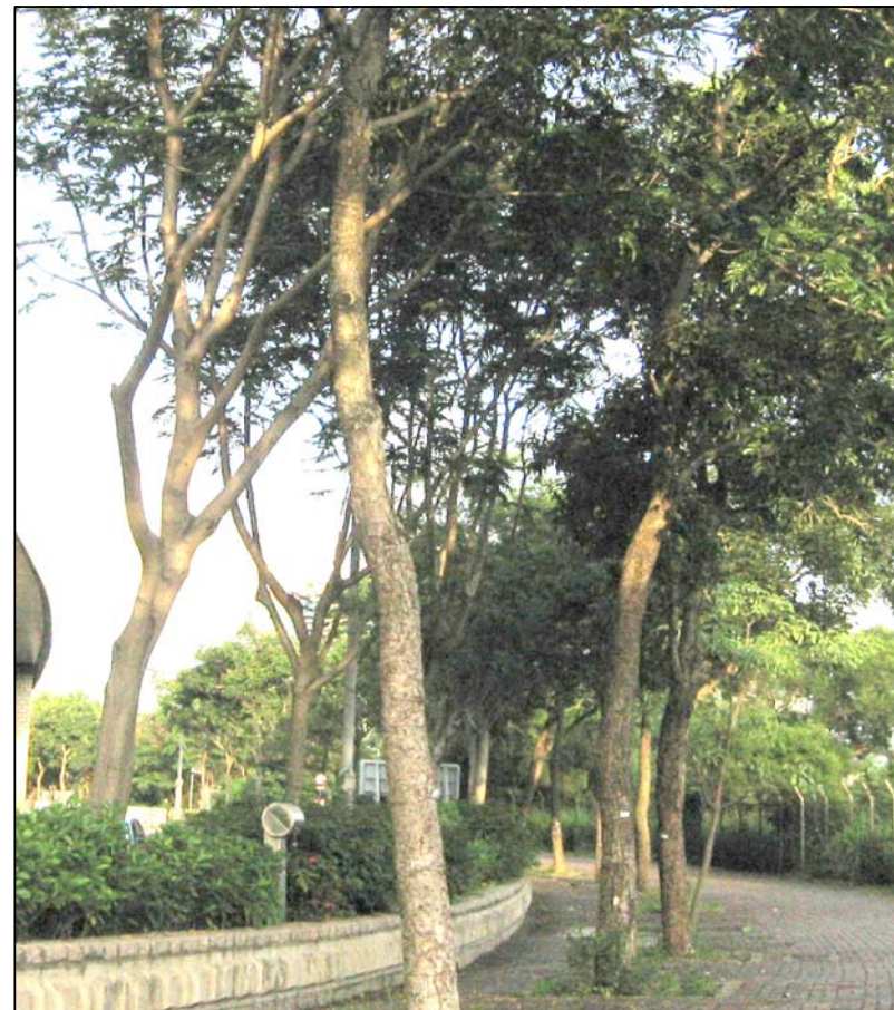
LR2.29 Roadside Plantation along Austin Road West Photo 2