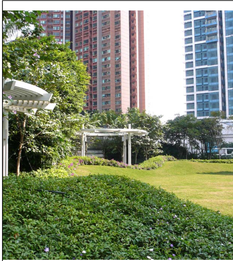
LR2.27 Amenity Planting within the private development at the Kowloon Station Photo 1