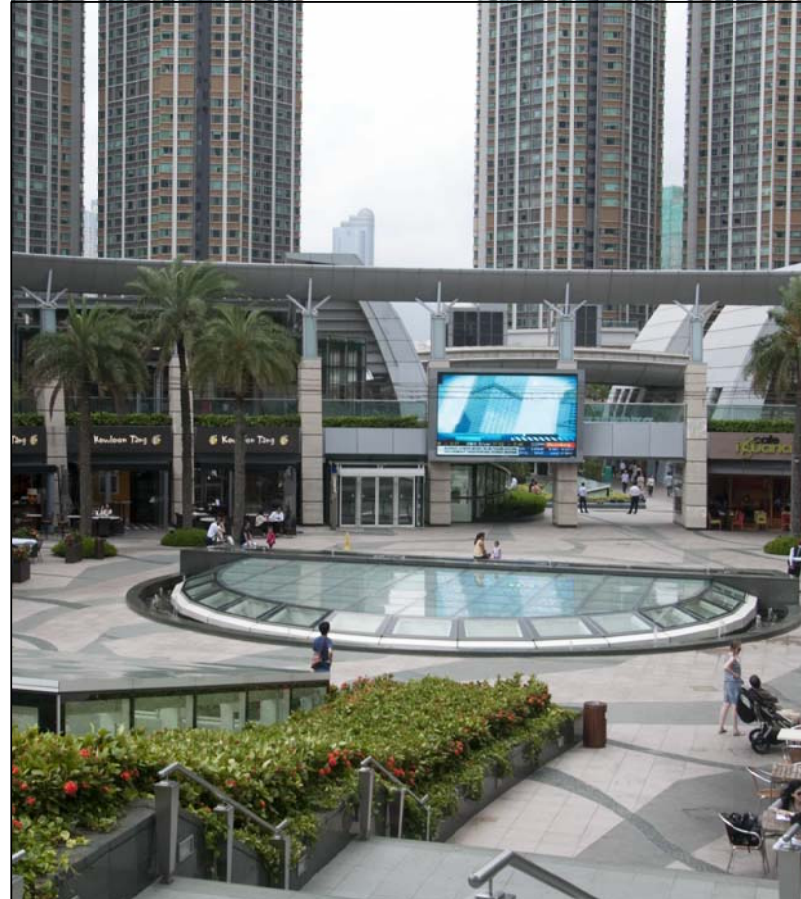
LR2.27 Amenity Planting within the private development at the Kowloon Station Photo 2