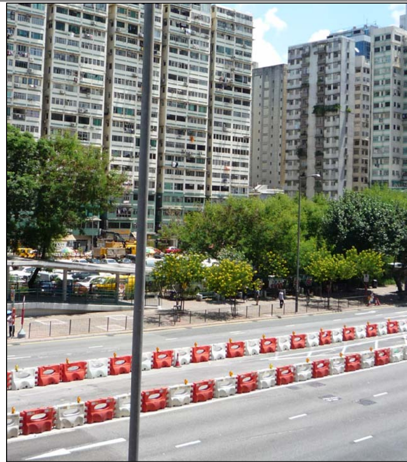
LR2.17 Roadside Plantation close to Jordan Road and Ferry Street Carpark Photo 1