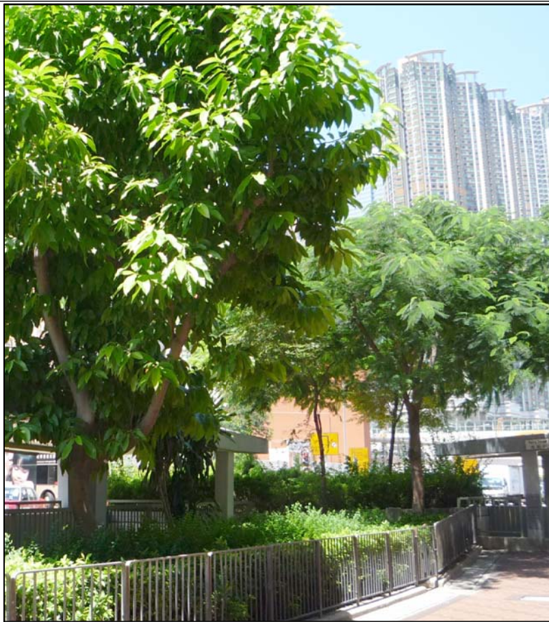
LR2.16 Roadside Plantation along Jordan Road Photo 2