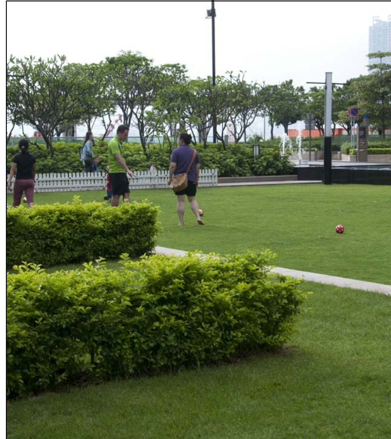
LR2.27 Amenity Planting within the private development at the Kowloon Station Photo 3