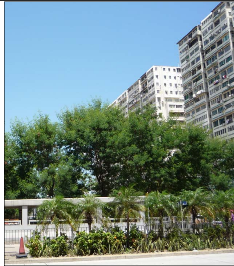
LR2.17 Roadside Plantation close to Jordan Road and Ferry Street Carpark Photo 2