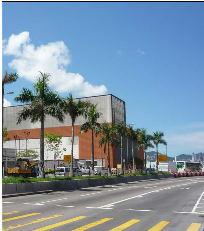
LR2.15 Roadside Plantation along Wui Cheung Road Photo 1