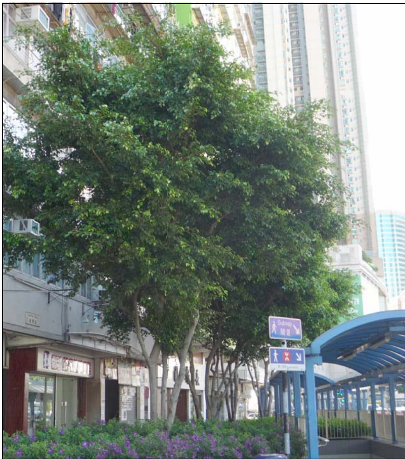
LR2.14 Roadside Plantation along Canton Road Photo 1