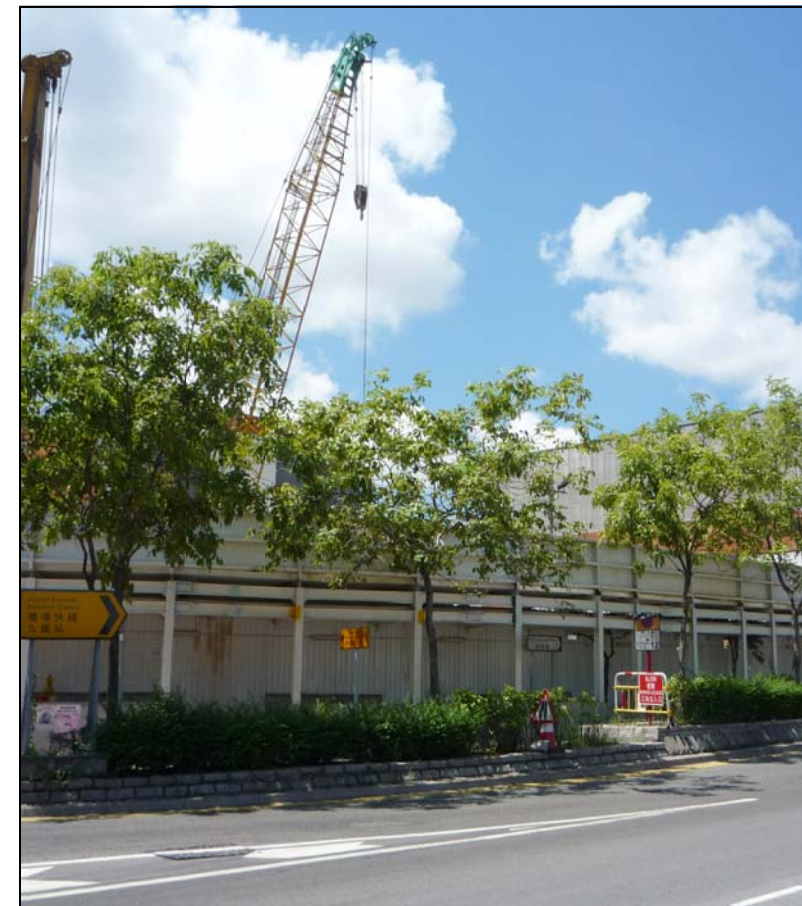
LR2.15 Roadside Plantation along Wui Cheung Road Photo 2