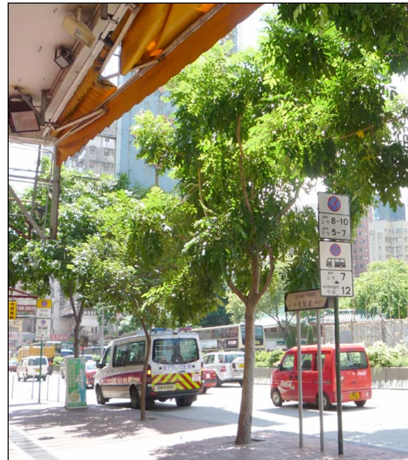
LR2.16 Roadside Plantation along Jordan Road Photo 1