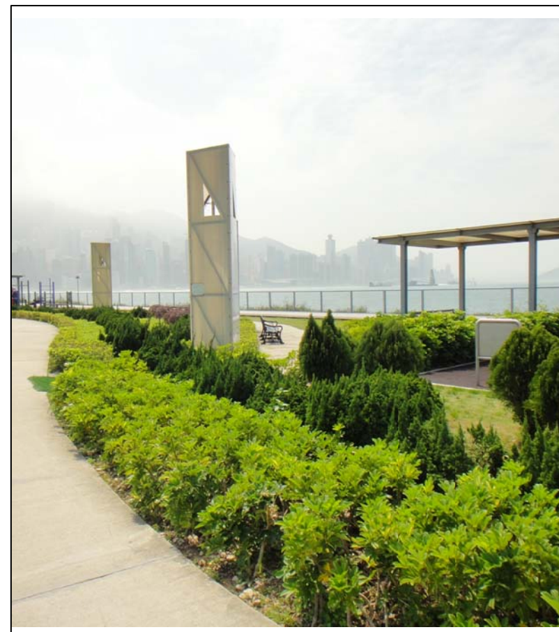
LR1.7 Temporary Open Space along the Waterfront Promenade within the site boundary Photo 4