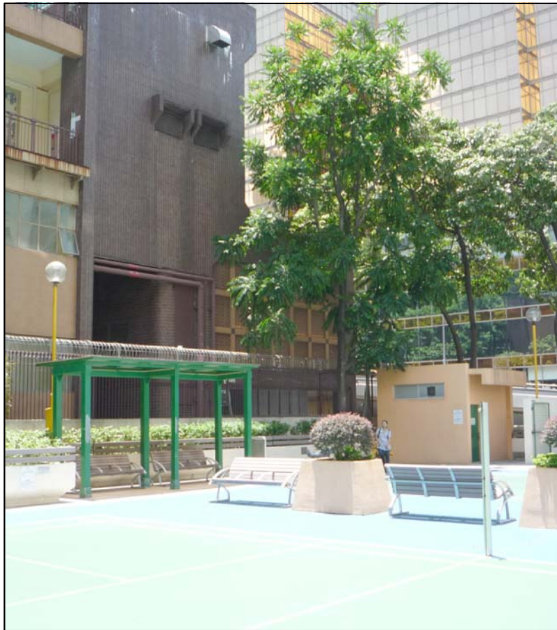
LR1.6 Canton Road Playground Photo 1