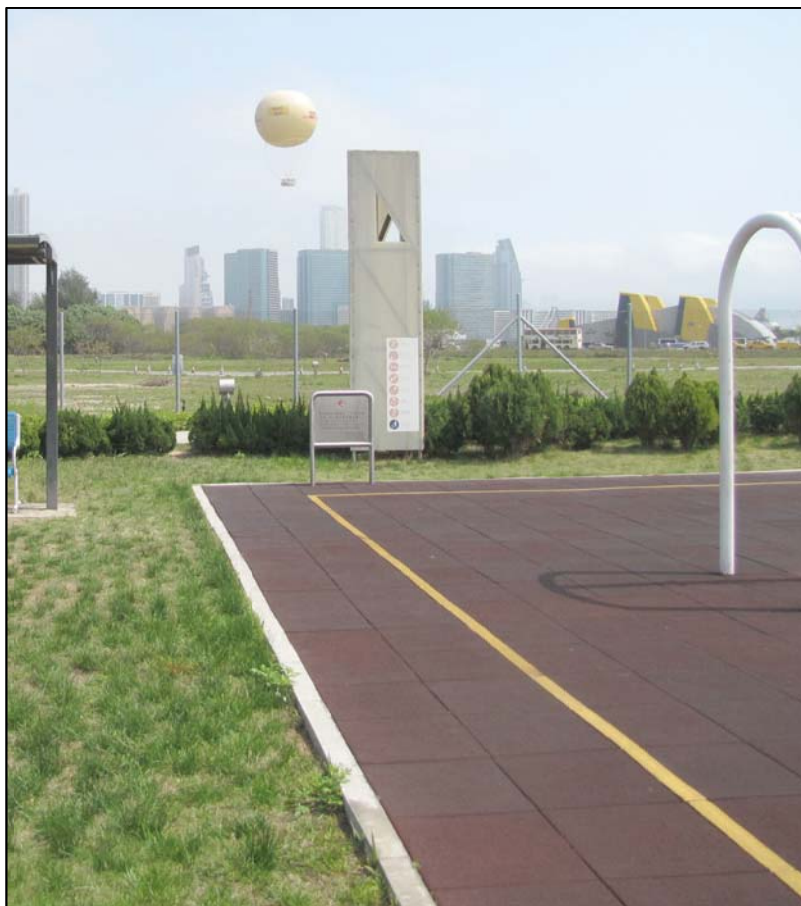
LR1.7 Temporary Open Space along the Waterfront Promenade within the site boundary Photo 2