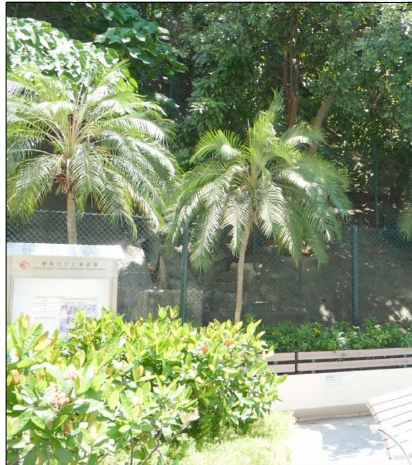
LR1.6 Canton Road Playground Photo 2