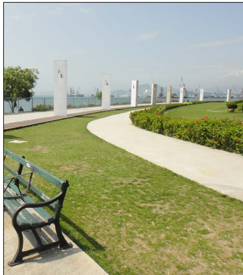
LR1.7 Temporary Open Space along the Waterfront Promenade within the site boundary Photo 3