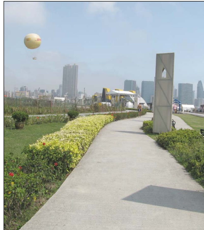
LR1.7 Temporary Open Space along the Waterfront Promenade within the site boundary Photo 1