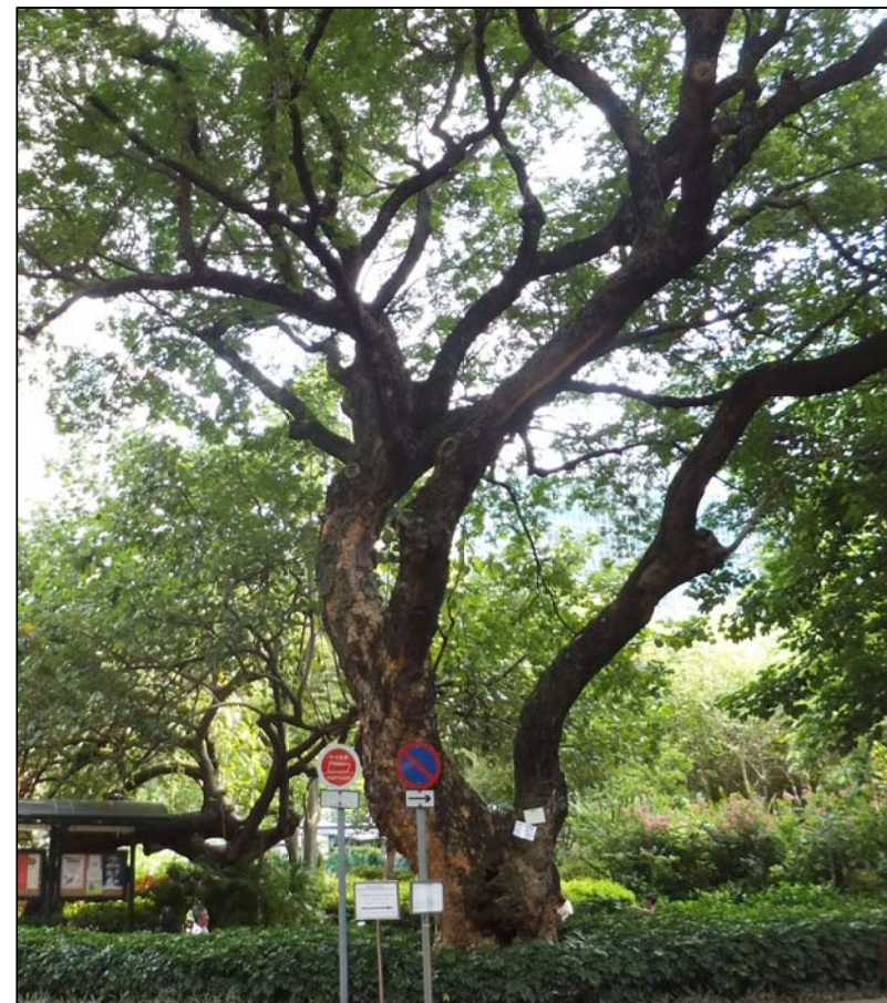
LR1.1 Kowloon Park Photo 5 - OVT (LCSD YTM/60)