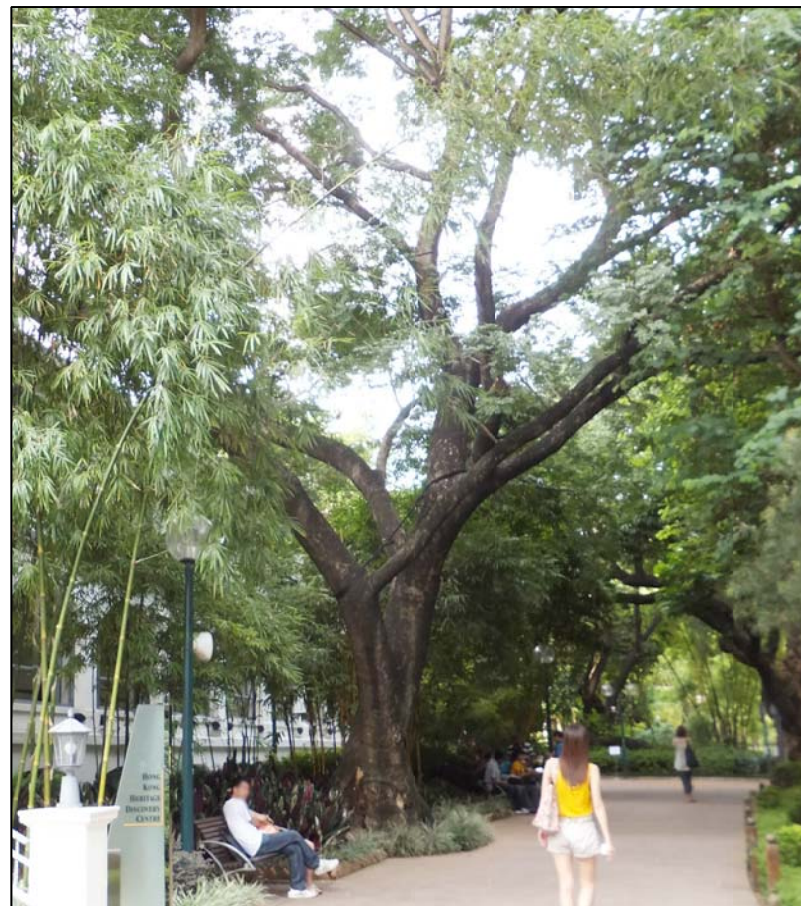
LR1.1 Kowloon Park Photo 4 - OVT (LCSD YTM/61)