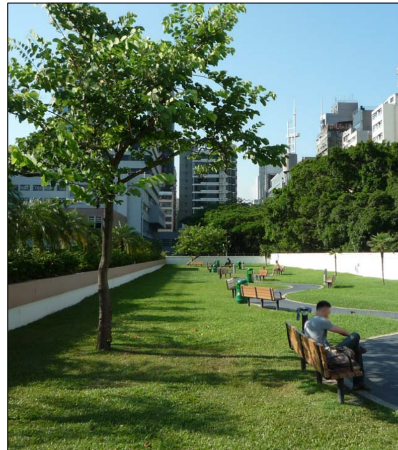
LR1.1 Kowloon Park Photo 3