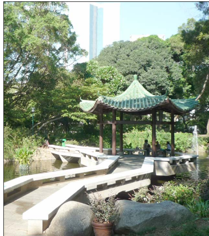
LR1.1 Kowloon Park Photo 2