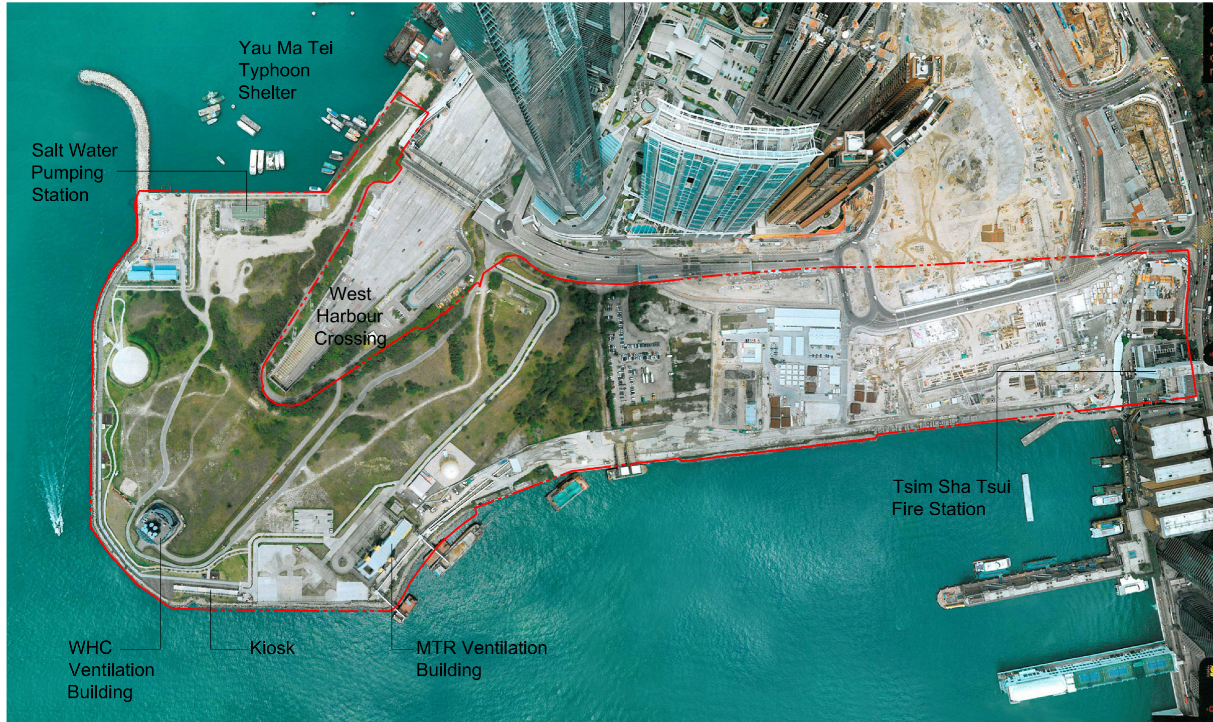
Notes: This aerial photo was taken on 27 March 2012 and is provided by Survey & Mapping Office, Lands Department, the Government of HKSAR.