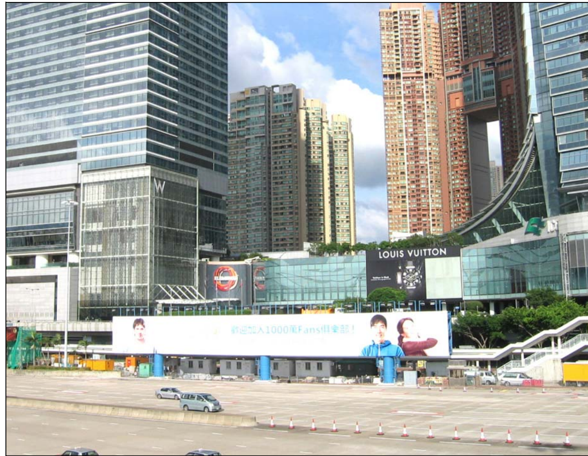
Photo VC17A (LCA09) Tsim Sha Tsui Late 20C/Early 21C Commercial/Residential Complex Landscape