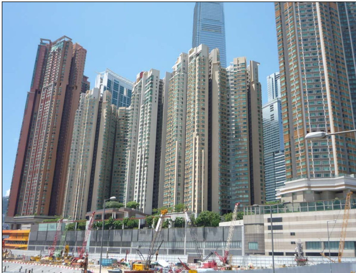
Photo VC18 (LCA09) Tsim Sha Tsui Late 20C/Early 21C Commercial/Residential Complex Landscape