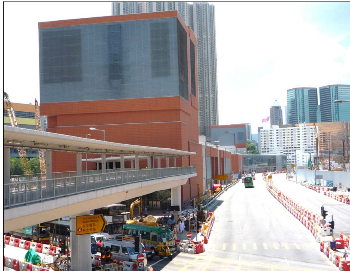
Photo VC19 (LCA10) Guangzhou-Shenzhen-Hong Kong Express Rail Link Terminus Construction Site & Austin Station