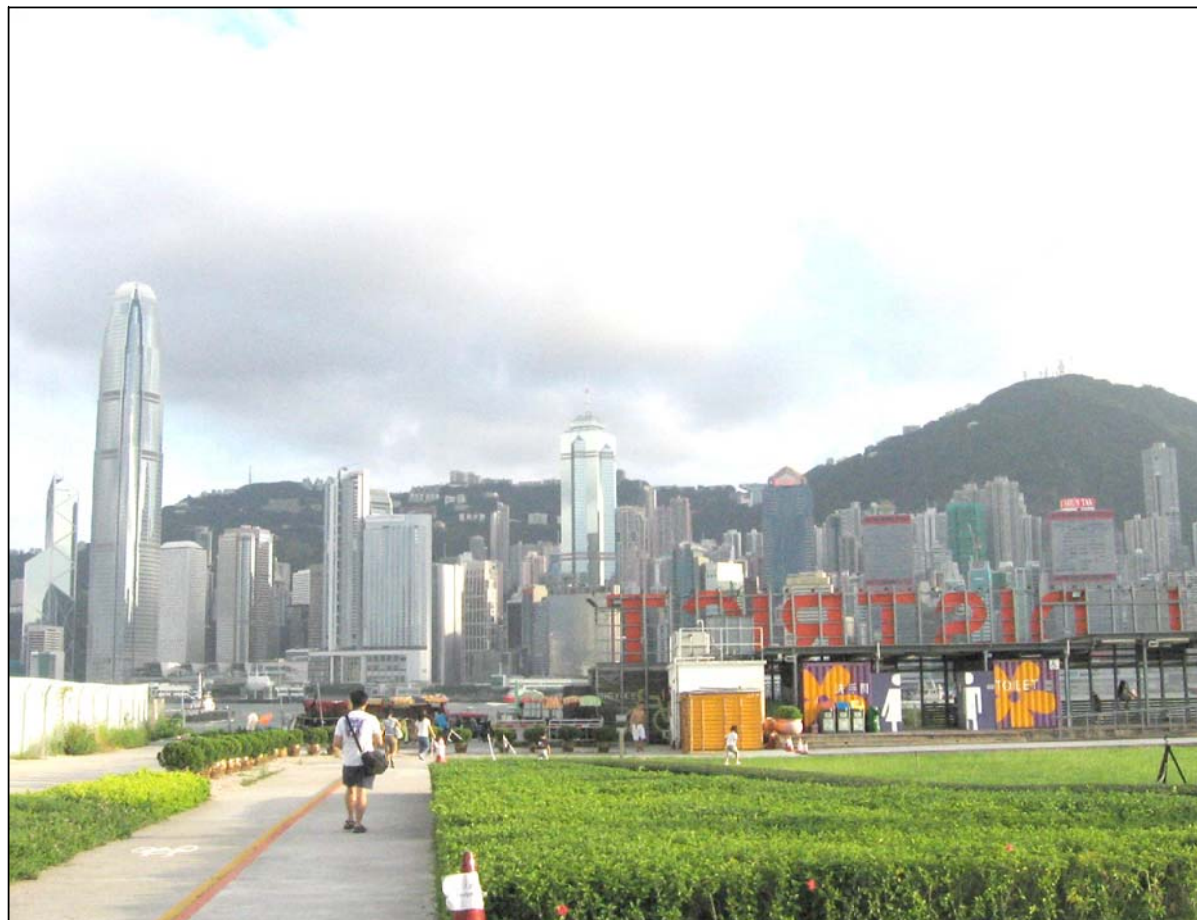
Photo VC07 (LCA03) West Kowloon Cultural District Temporary Waterfront Promenade