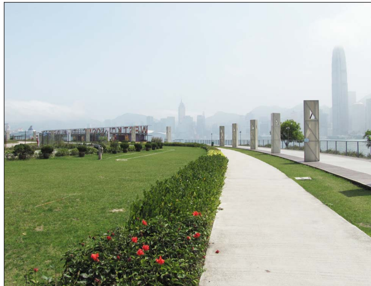
Photo VC08 (LCA03) West Kowloon Cultural District Temporary Waterfront Promenade