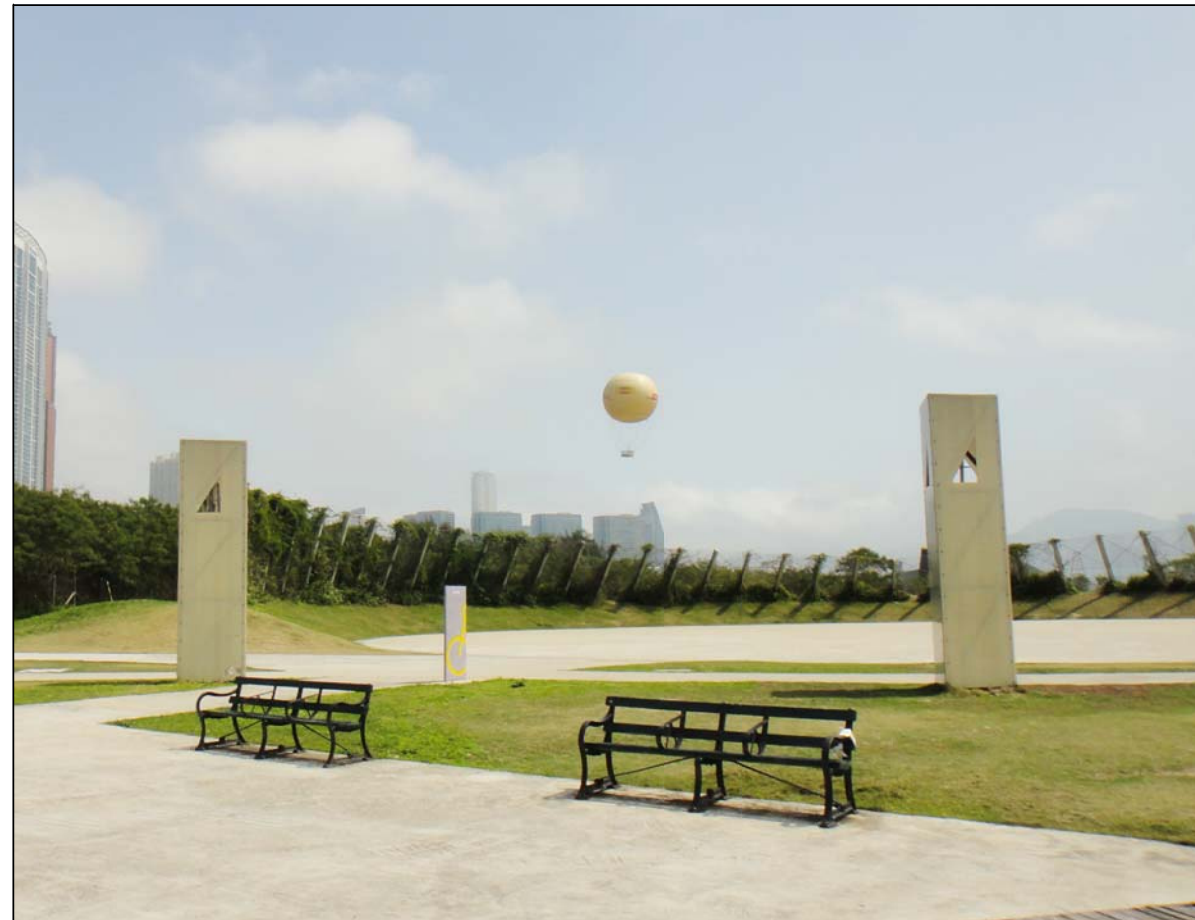
Photo VC06 (LCA03) West Kowloon Cultural District Temporary Waterfront Promenade