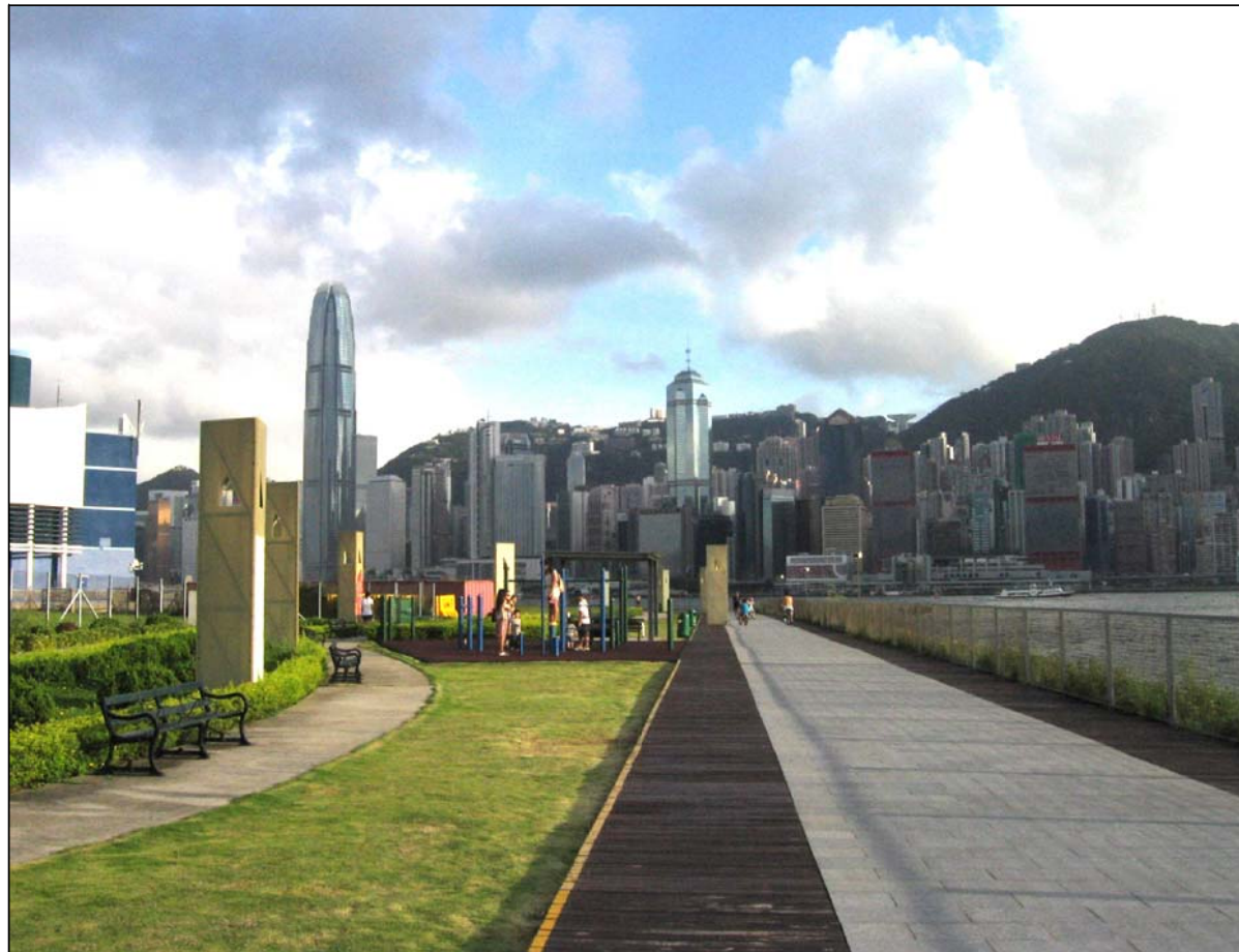
Photo VC05 (LCA03) West Kowloon Cultural District Temporary Waterfront Promenade