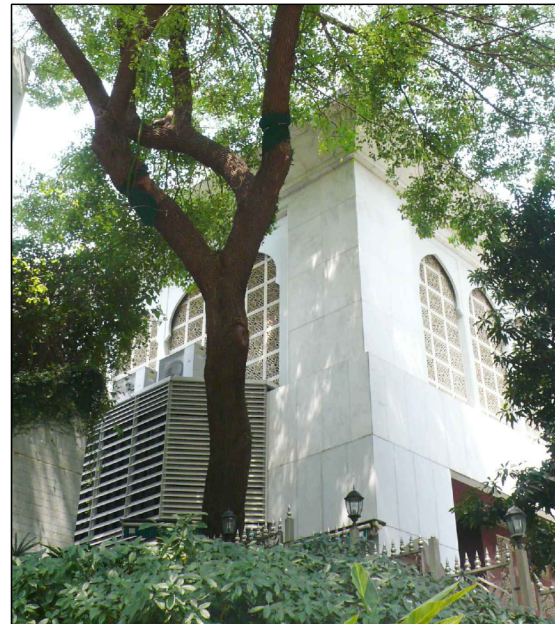
LR4.1 Kowloon Mosque and Islamic Centre Photo 1