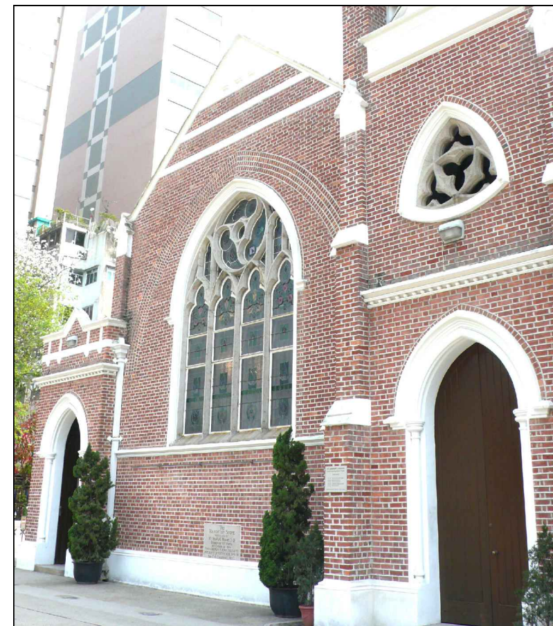
LR4.2 St. Andrew's Church and Former Kowloon British School Photo 2 - St. Andrew's Church