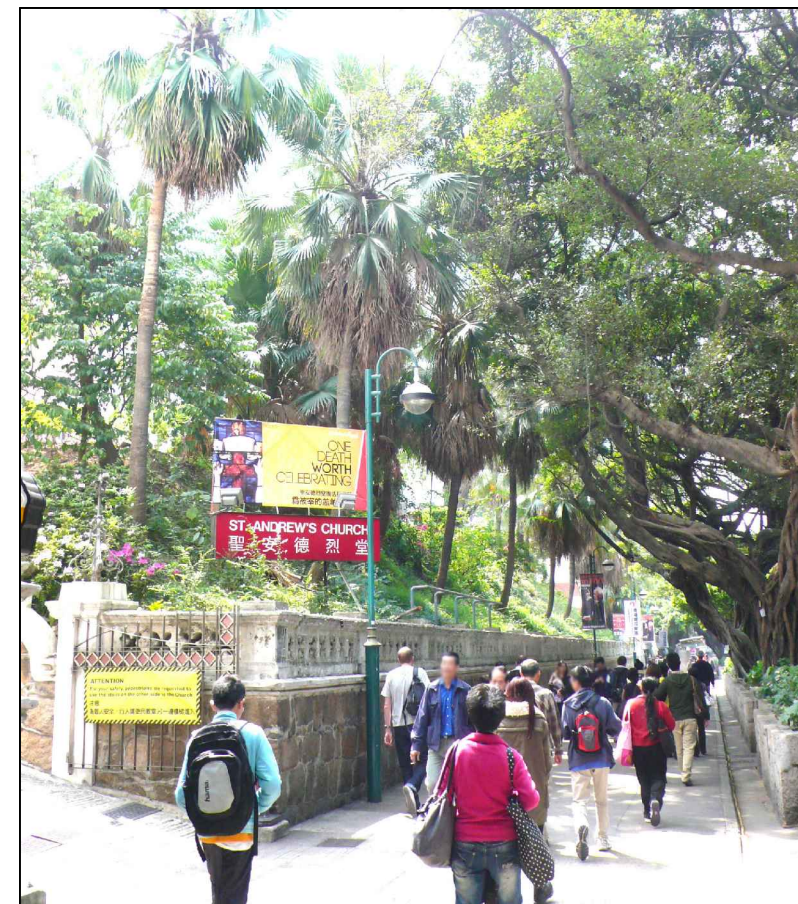
LR4.2 St. Andrew's Church and Former Kowloon British School Photo 1