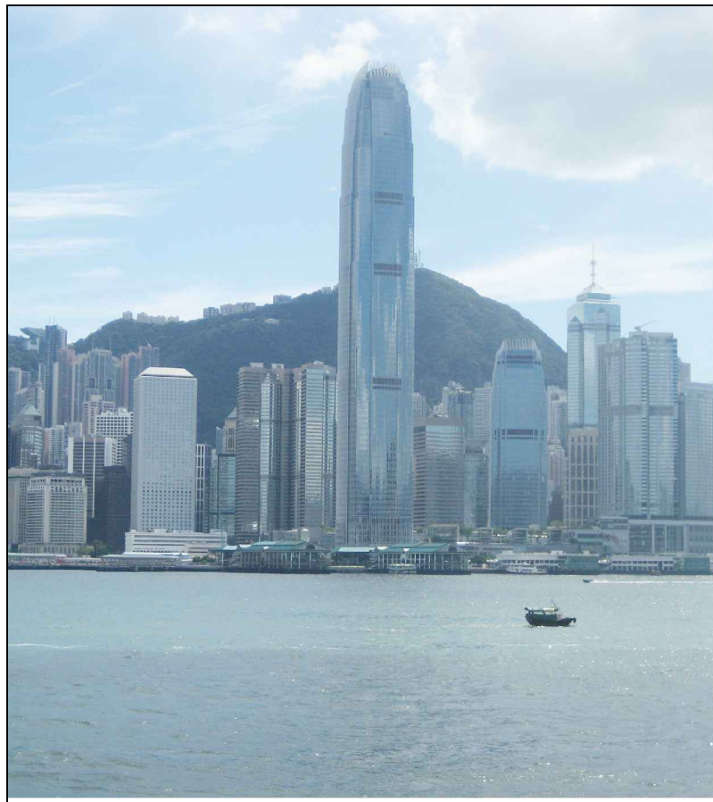
LR3.1 Victoria Harbour Photo 1