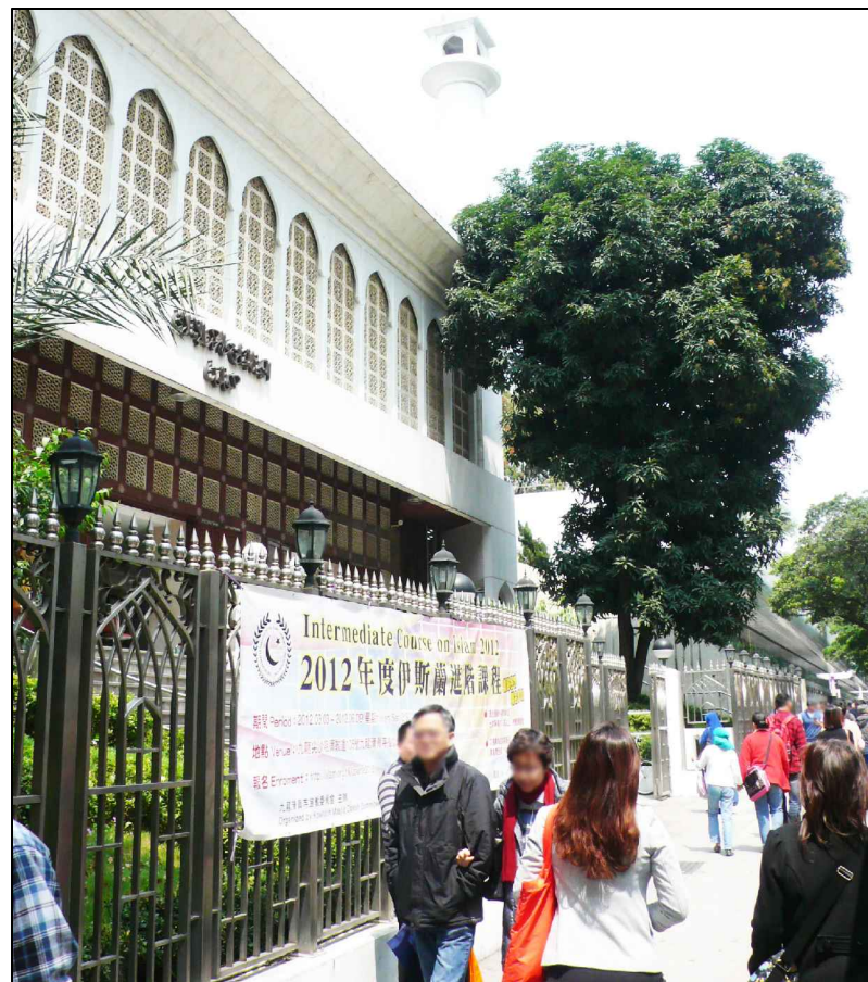
LR4.1 Kowloon Mosque and Islamic Centre Photo 2