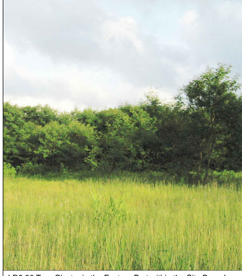
LR2.36 Tree Cluster in the Eastern Part within the Site Boundary Photo 1