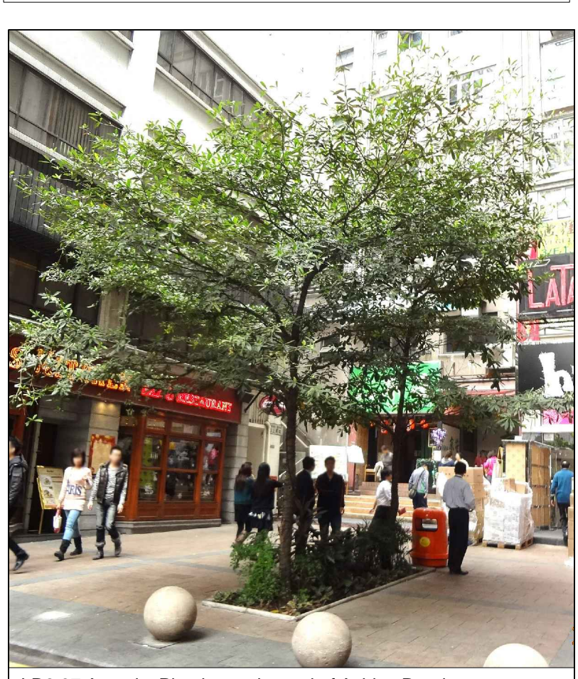
LR2.37 Amenity Planting at the end of Ashley Road Photo 1