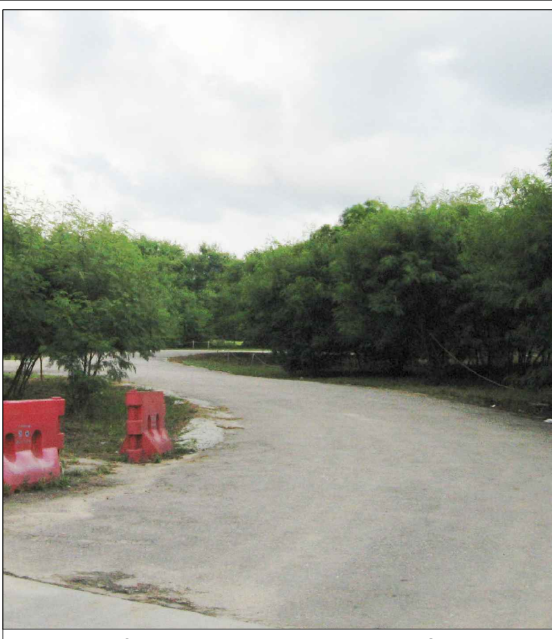
LR2.35 Tree Cluster in the Western Part within the Site Boundary Photo 2