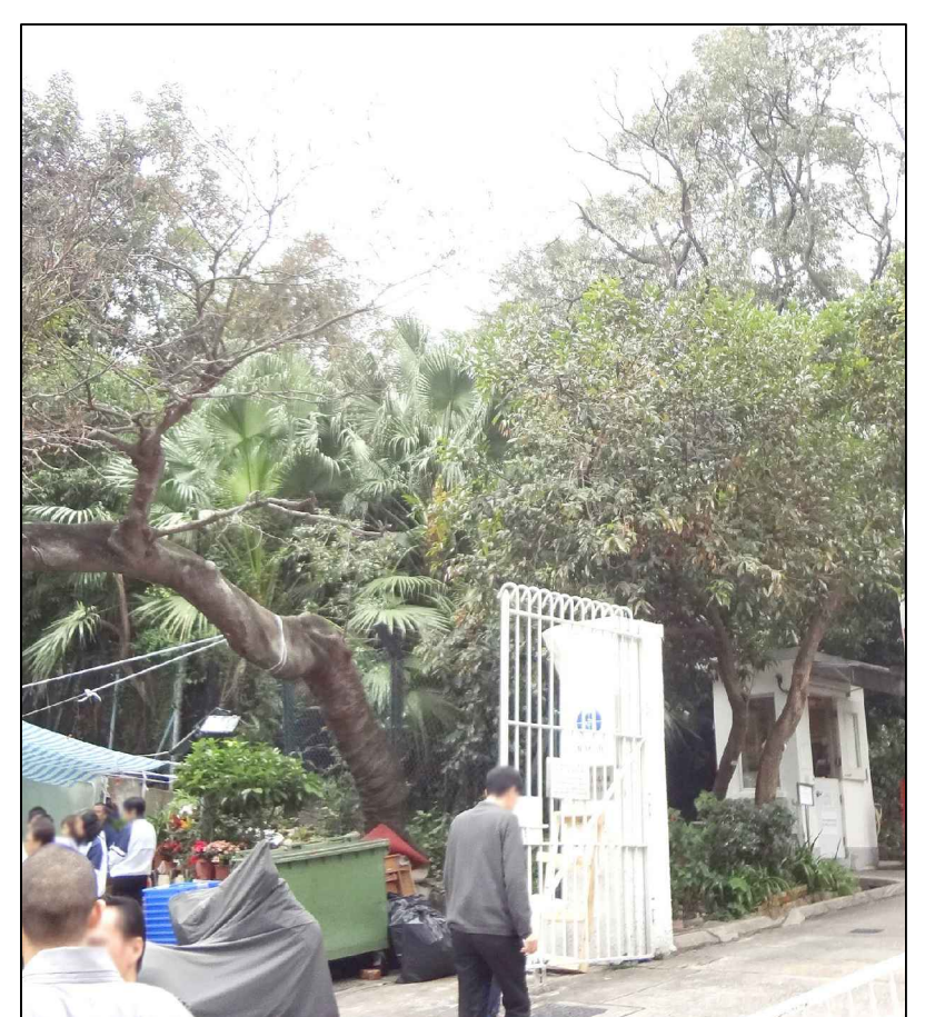
LR2.38 Amenity Planting next to Hong Kong Observatory Building Photo 1