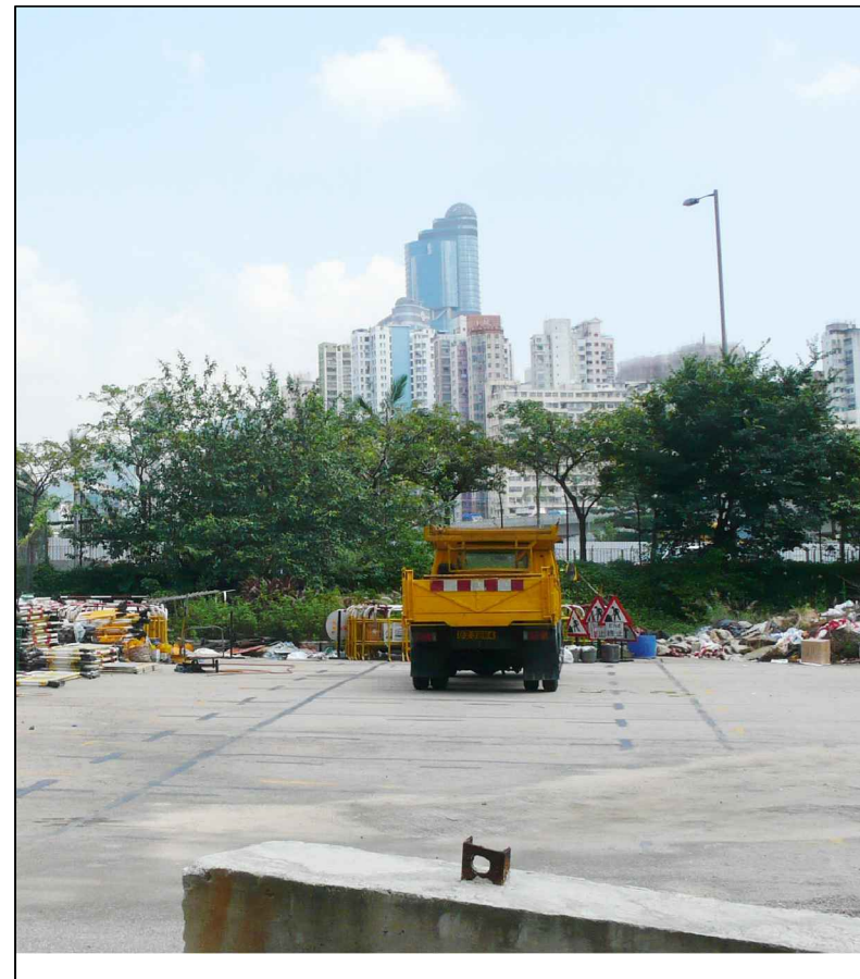
LR2.24 Trees within construction site and vacant land near Man Cheong Street Photo 2