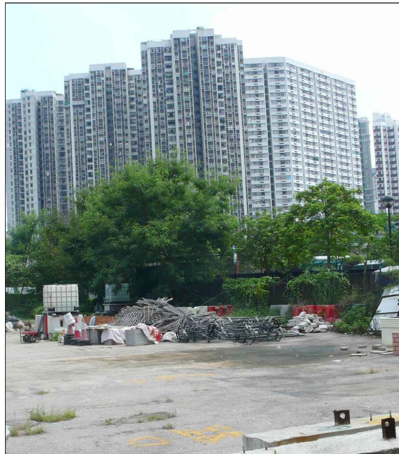
LR2.24 Trees within construction site and vacant land near Man Cheong Street Photo 1