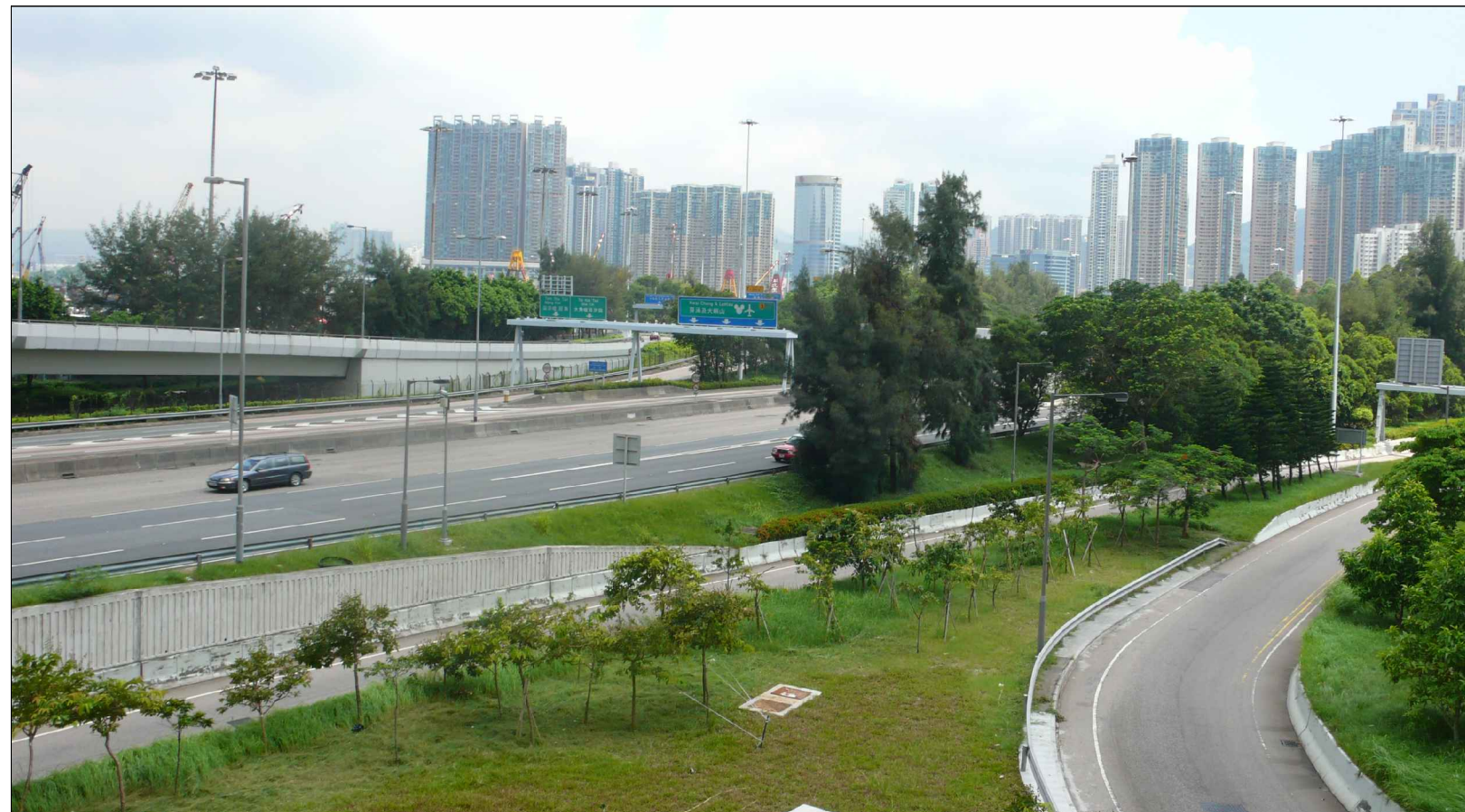
LR2.26 Trees along West Kowloon Highway Photo 1