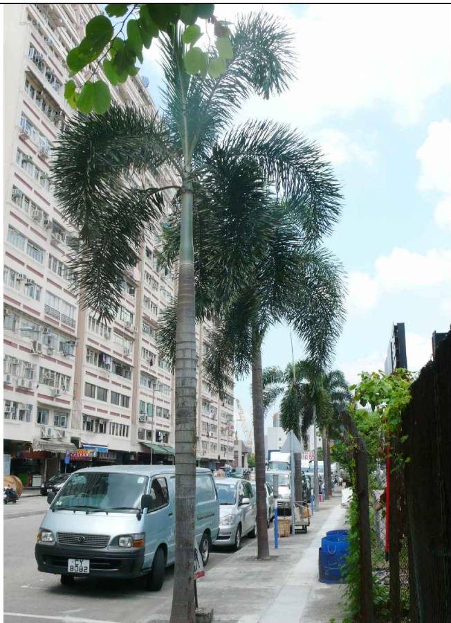
LR2.23 Trees along Man Cheong Street Photo 1