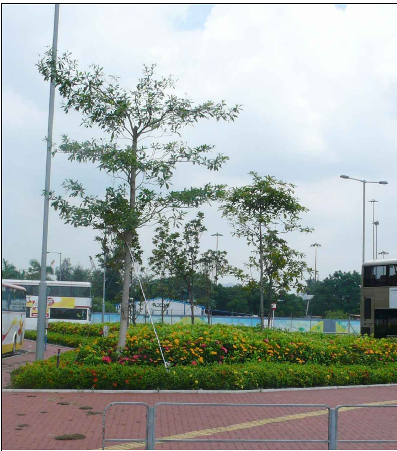
LR2.25 Amenity Planting at the Bus Terminal near Jordan Road Photo 1