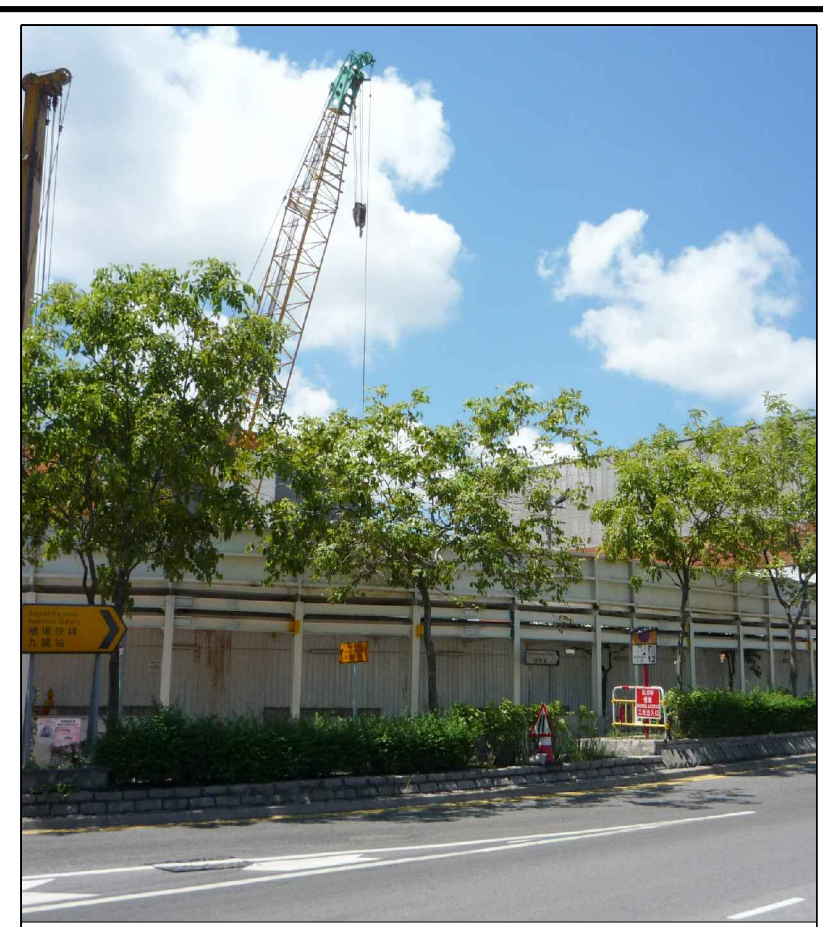
LR2.15 Roadside Plantation along Wui Cheung Road Photo 2