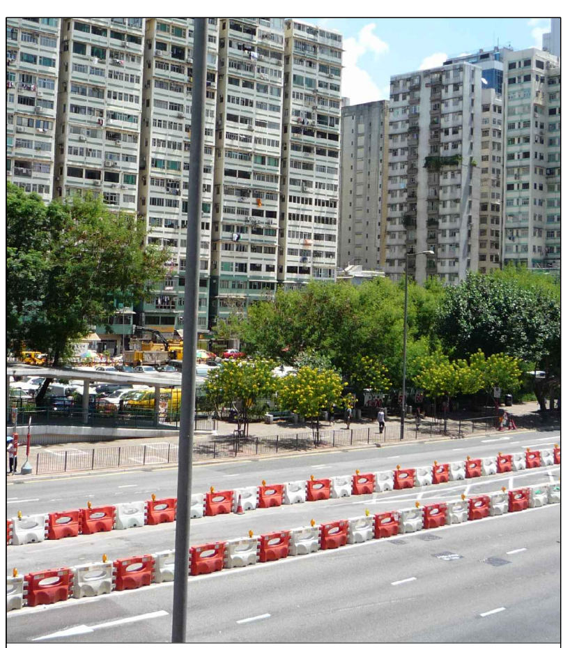
LR2.17 Roadside Plantation close to Jordan Road and Ferry Street Carpark Photo 1