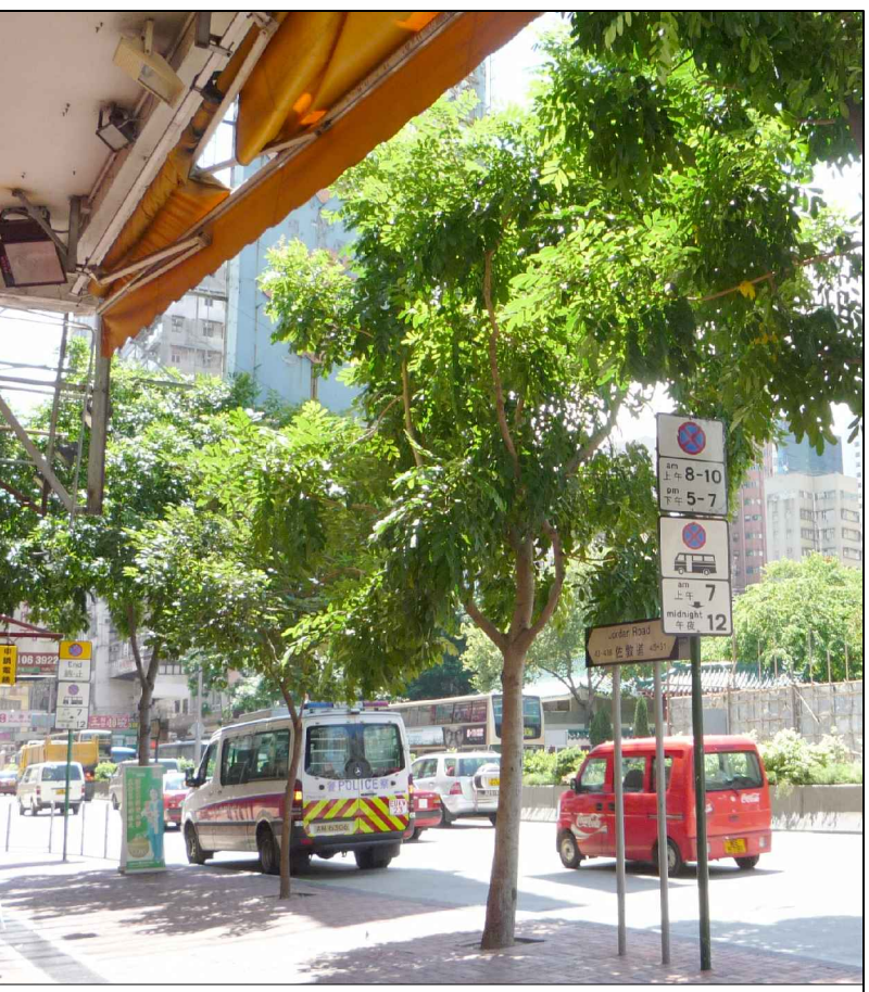
LR2.16 Roadside Plantation along Jordan Road Photo 1