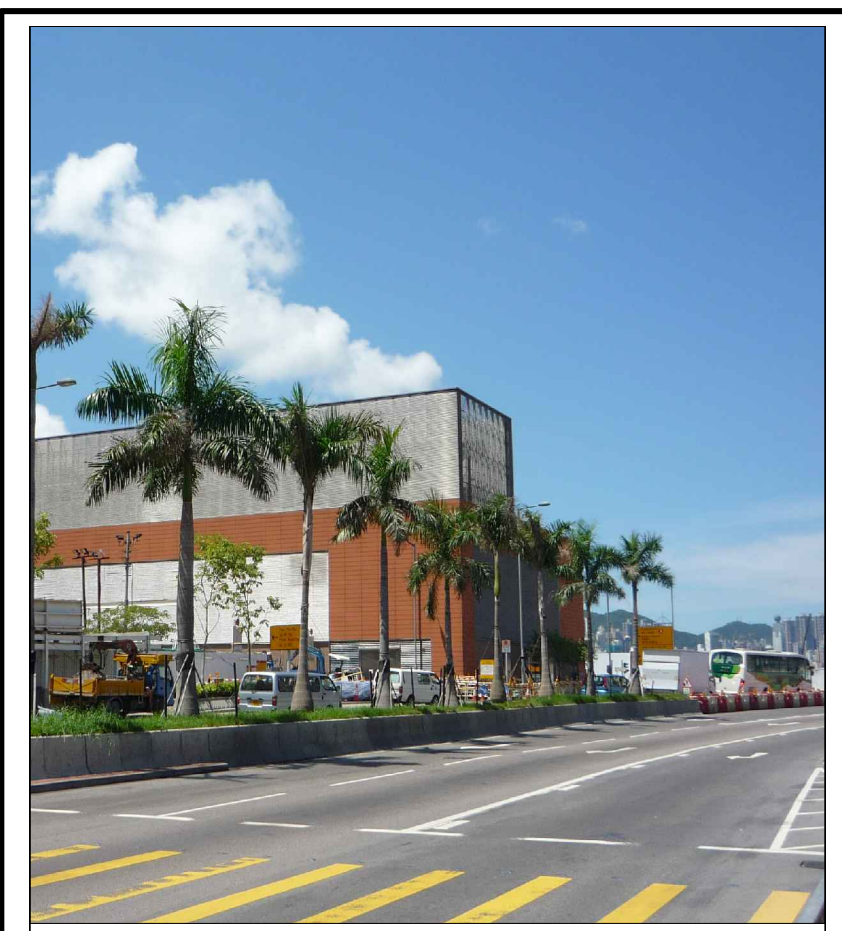
LR2.15 Roadside Plantation along Wui Cheung Road Photo 1