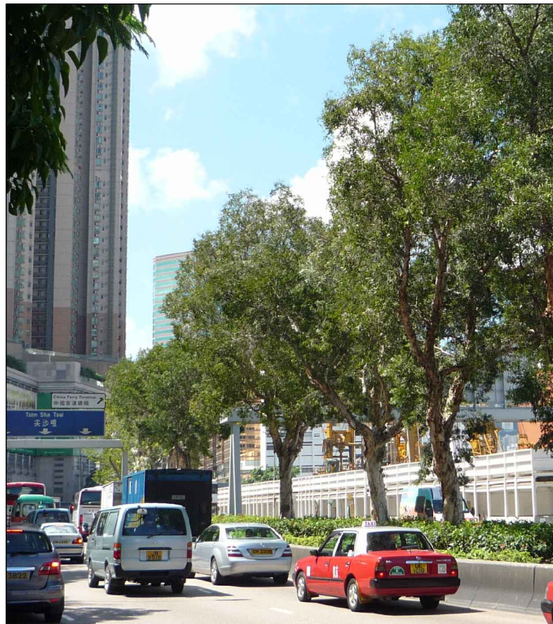
LR2.14 Roadside Plantation along Canton Road Photo 2