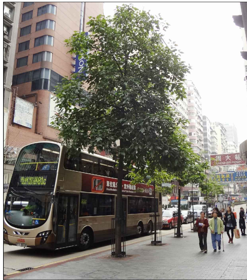
LR2.13 Roadside Plantation along Nathan Road Photo 2