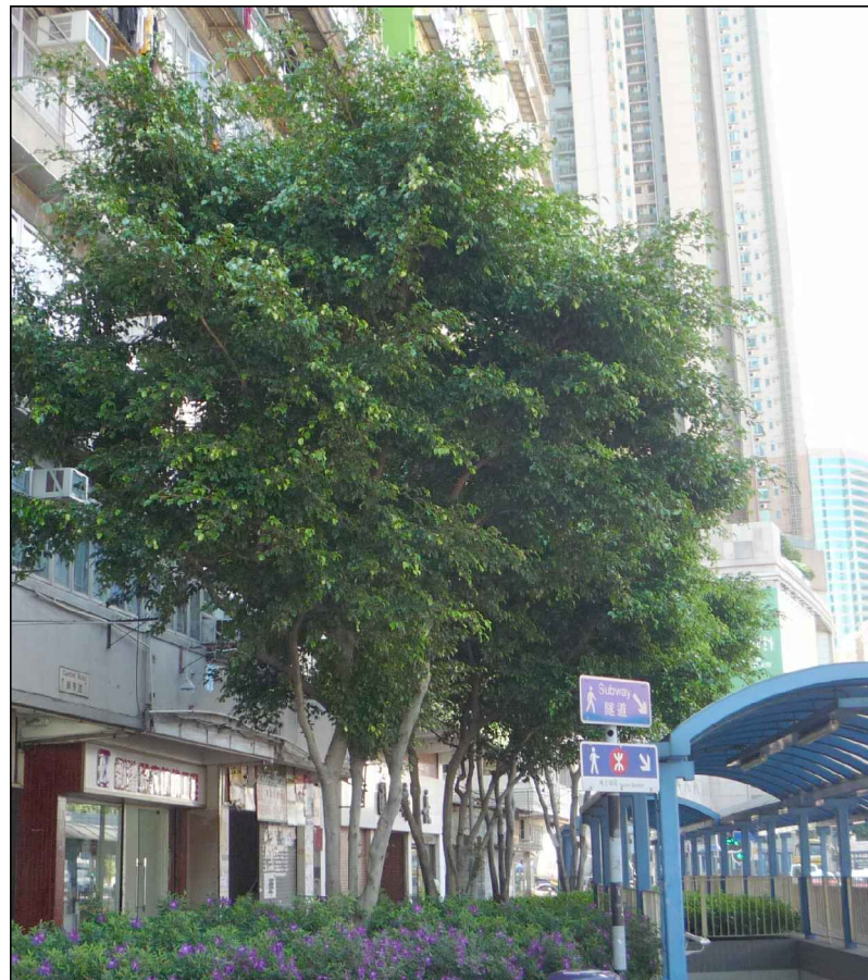
LR2.14 Roadside Plantation along Canton Road Photo 1