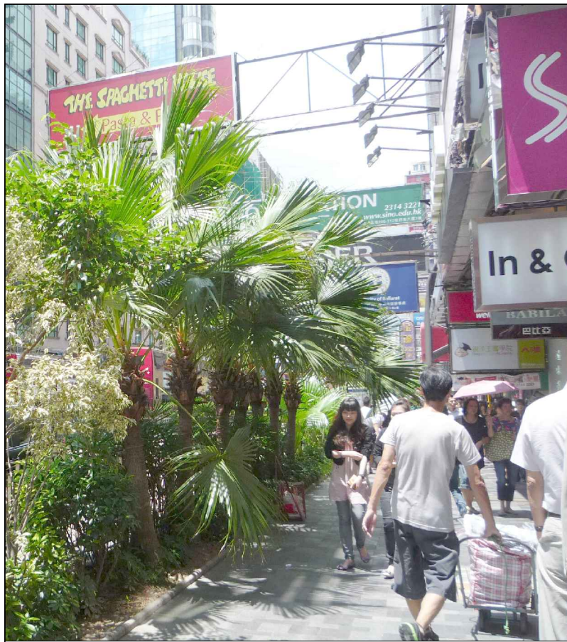
LR2.13 Roadside Plantation along Nathan Road Photo 1