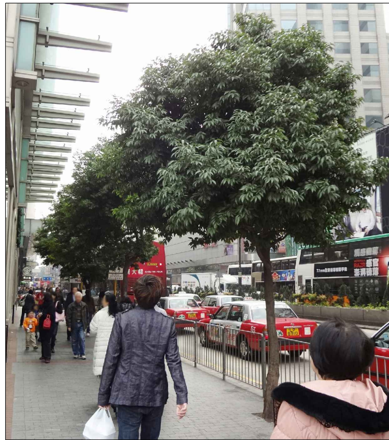
LR2.13 Roadside Plantation along Nathan Road Photo 3