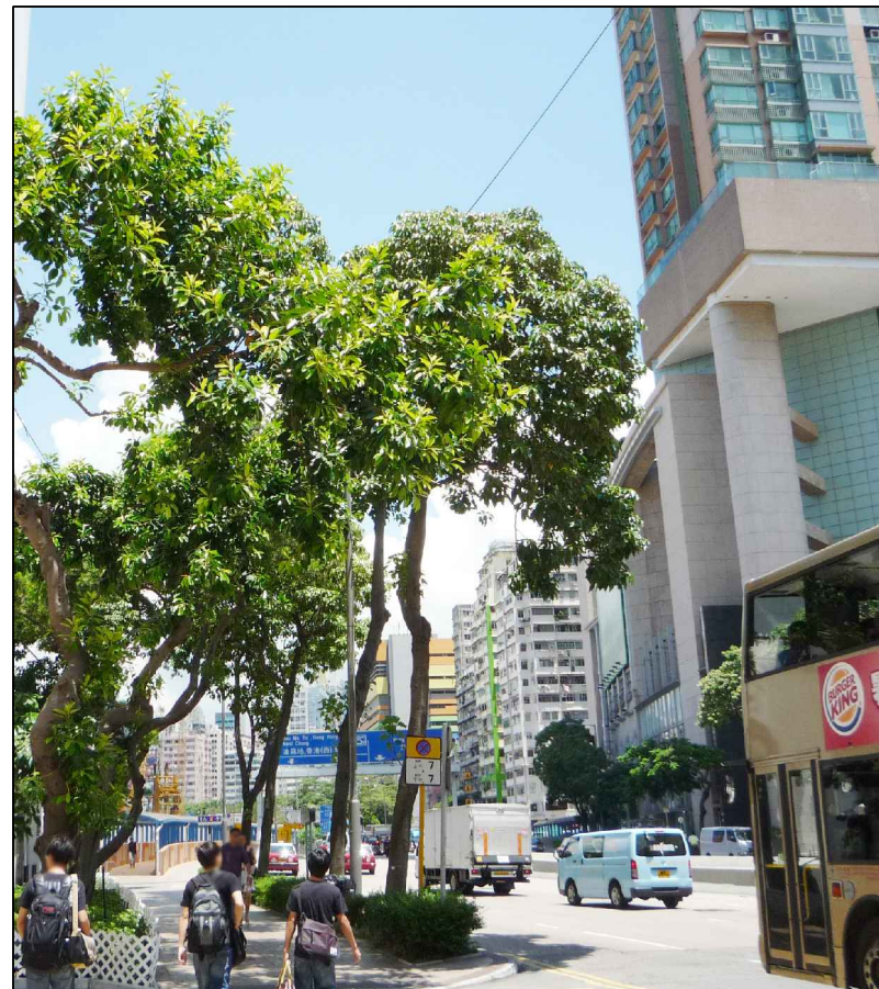
LR2.9 Roadside Plantation in front of Tsim Sha Tsui Fire Station Photo 1