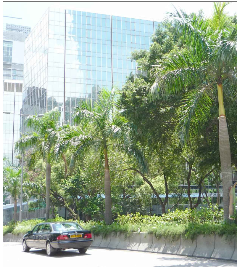
LR2.7 Amenity Planting Strip along Kowloon Park Drive Photo 1