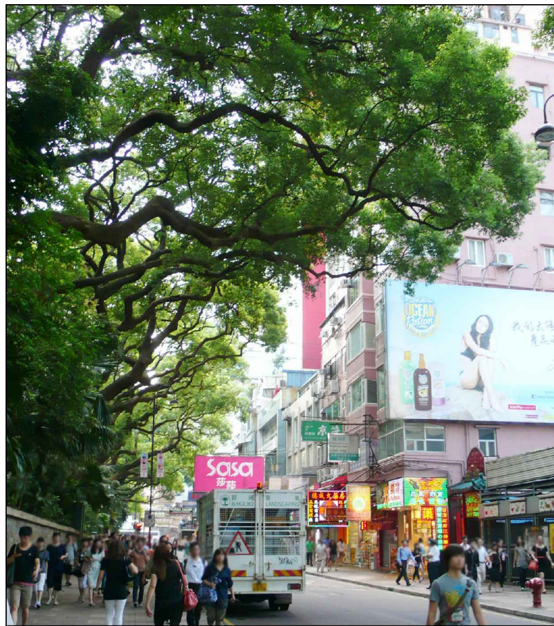
LR2.6 Roadside Plantation along Haiphong Road Photo 2