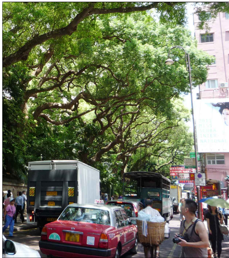
LR2.6 Roadside Plantation along Haiphong Road Photo 1