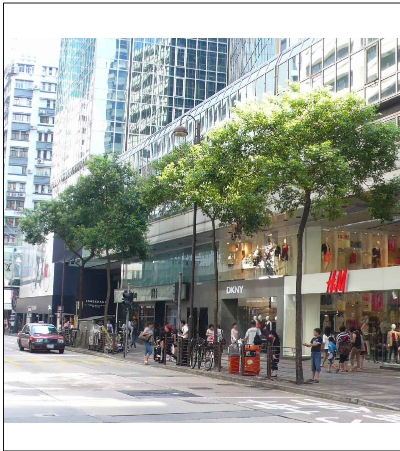
LR2.5 Roadside Trees along Canton Road in front of Lippo Sun Plaza Photo 1