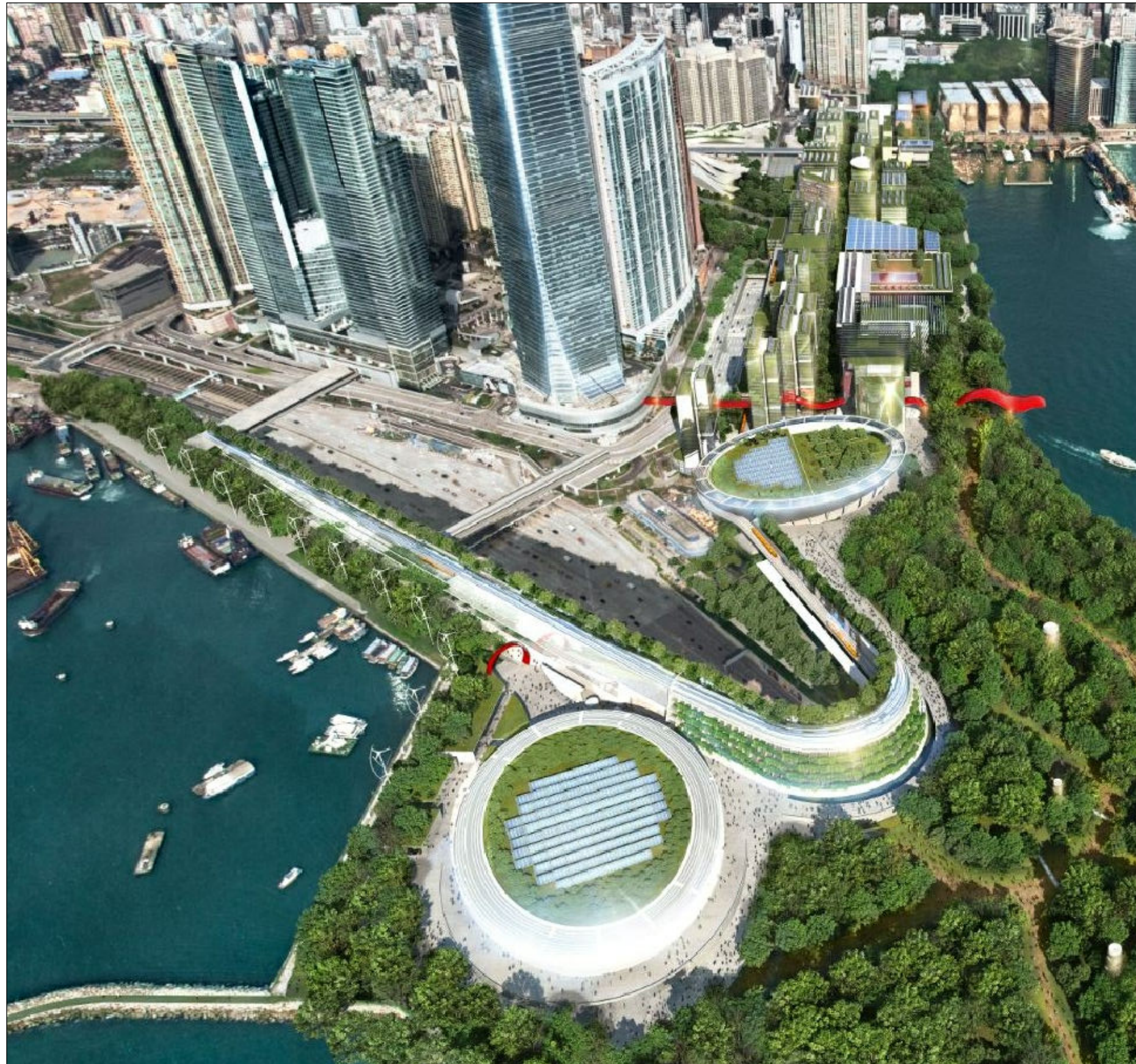
Notes: Indicative appearance from the WKCD Concept Plan.