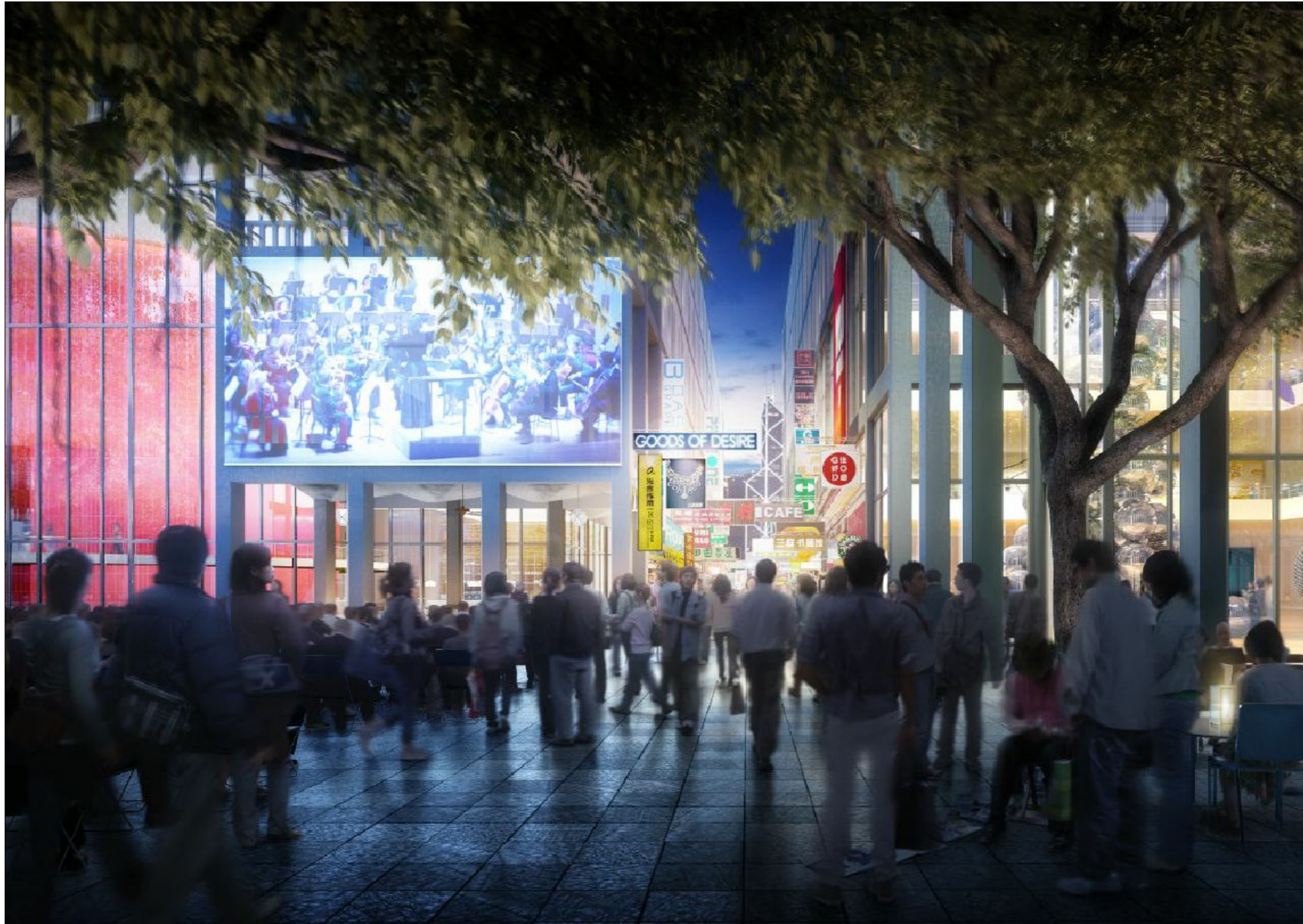
Notes: Indicative appearance from the WKCD Concept Plan.