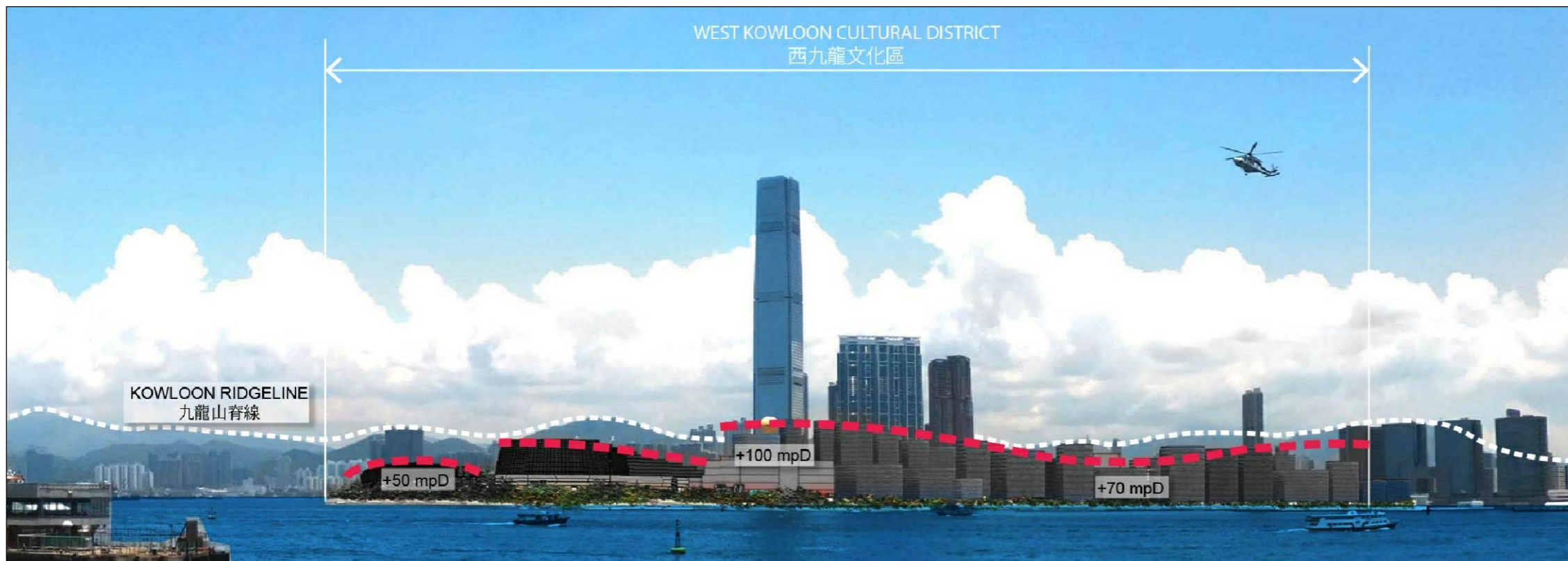
BUILDING HEIGHT PROFILE

Title SITE SECTION AND BUILDING HEIGHT PROFILE