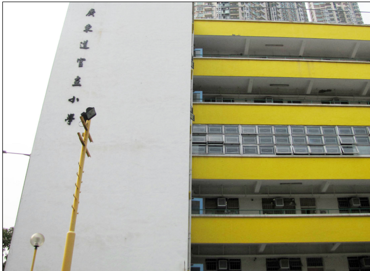
VSR 34 Canton Road Government Primary School