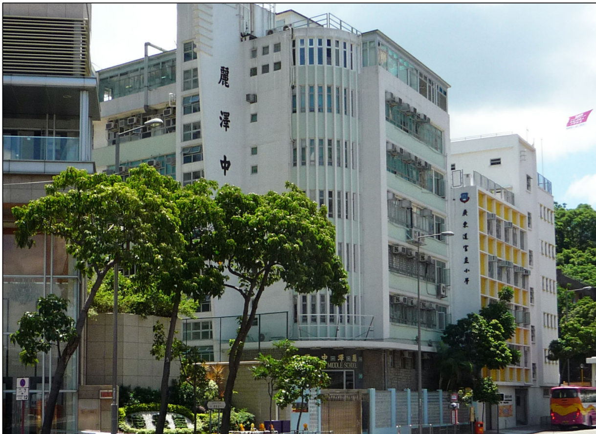
VSR 33 Lai Chack Middle School