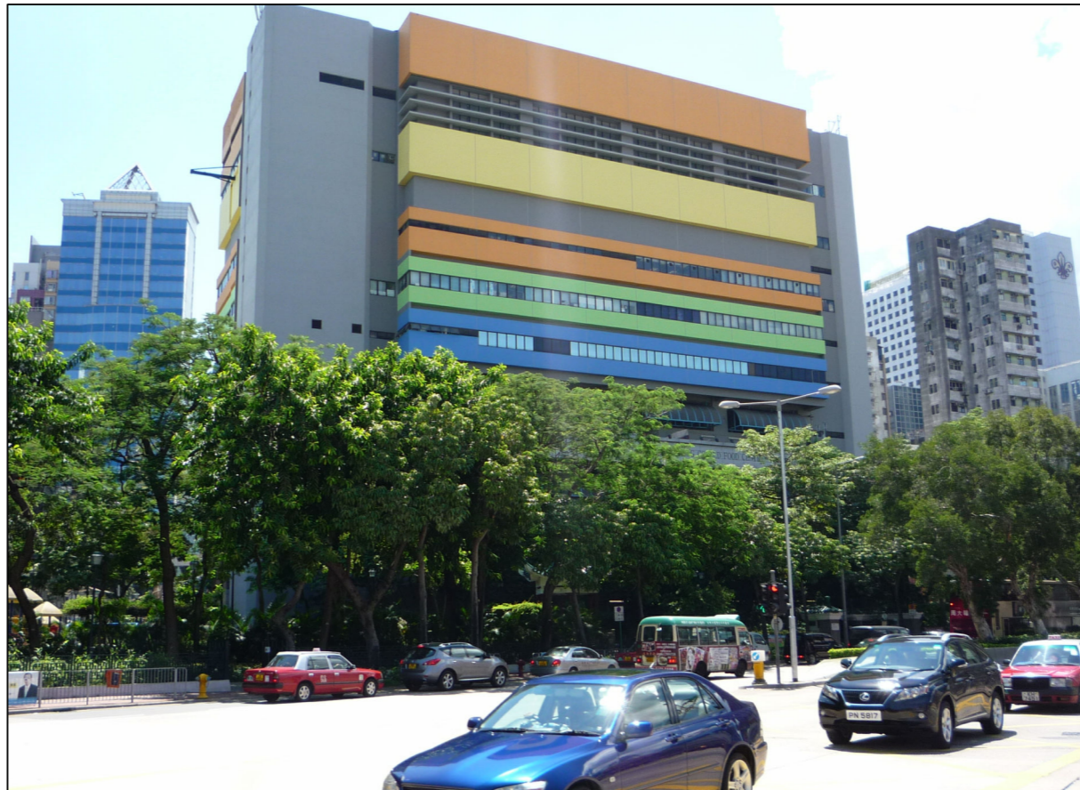
VSR 32 Kwun Chung Municipal Services Building