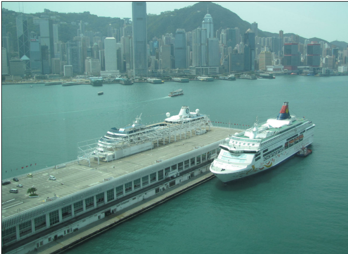
VSR 31 Ocean Terminal