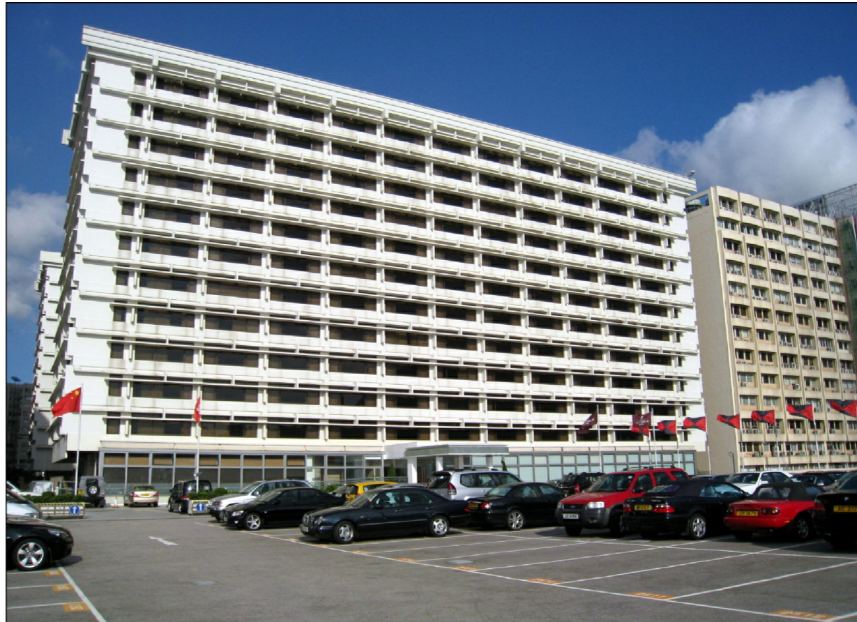
VSR 28 The Macro Polo Hong Kong Hotel