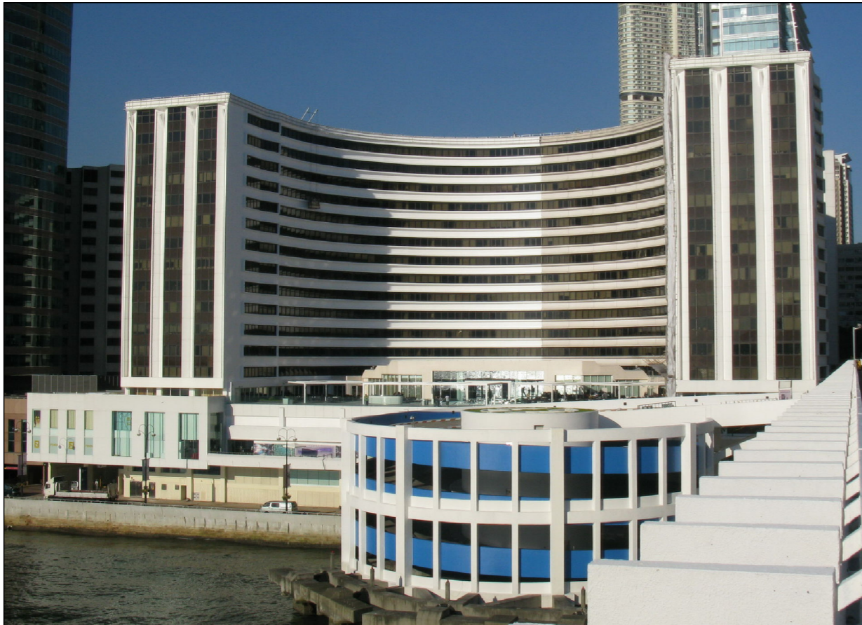
VSR 27 Harbour City and Ocean Centre