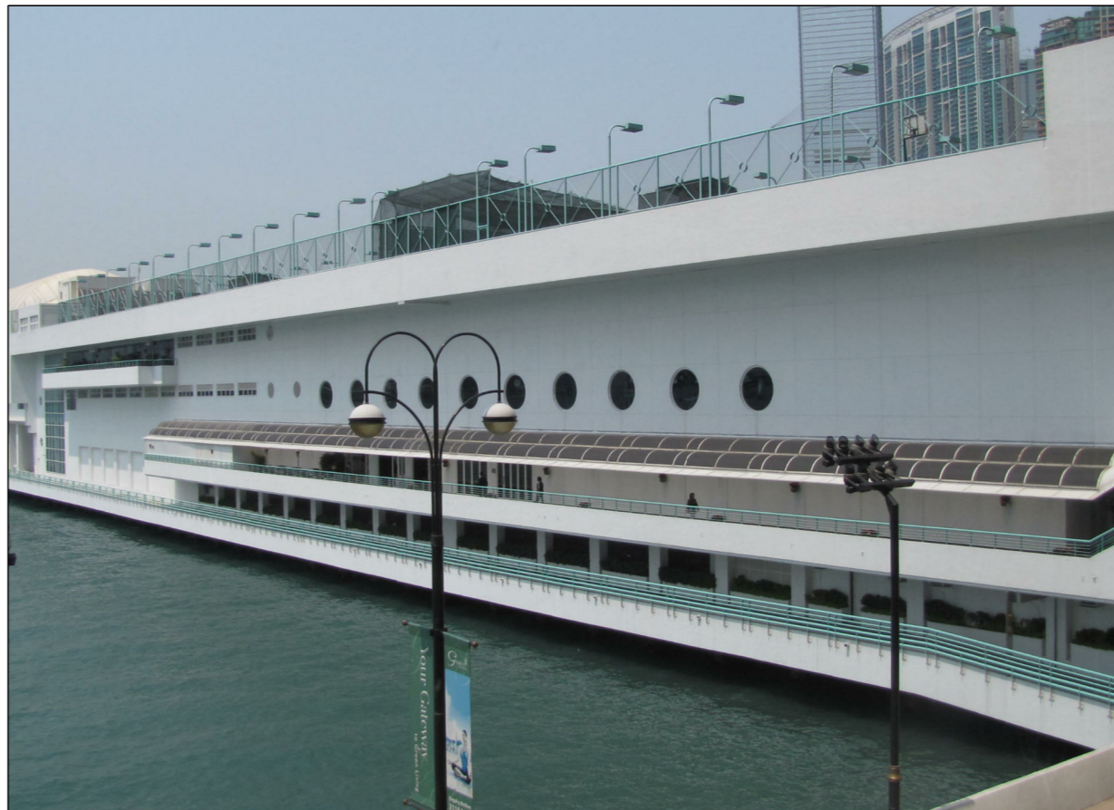
VSR 30 Pacific Club Kowloon