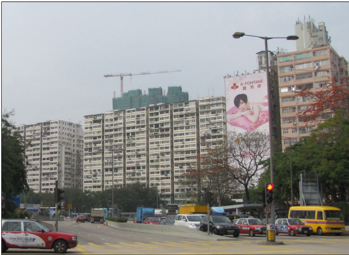
VSR 22 Man King Building and Man Wah Building & VSR 23 Lee Kiu Building and Wai Ching Court