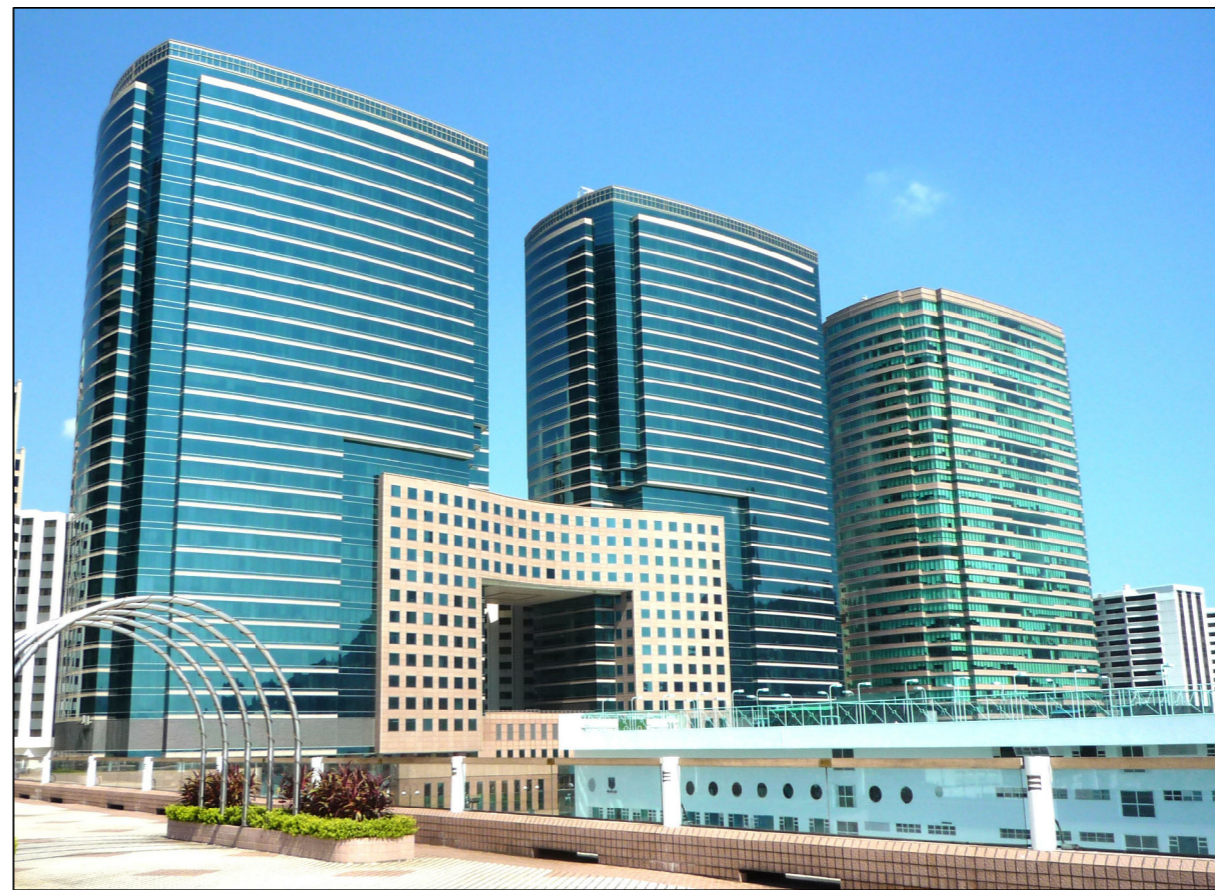
VSR 26 Gateway Hong Kong