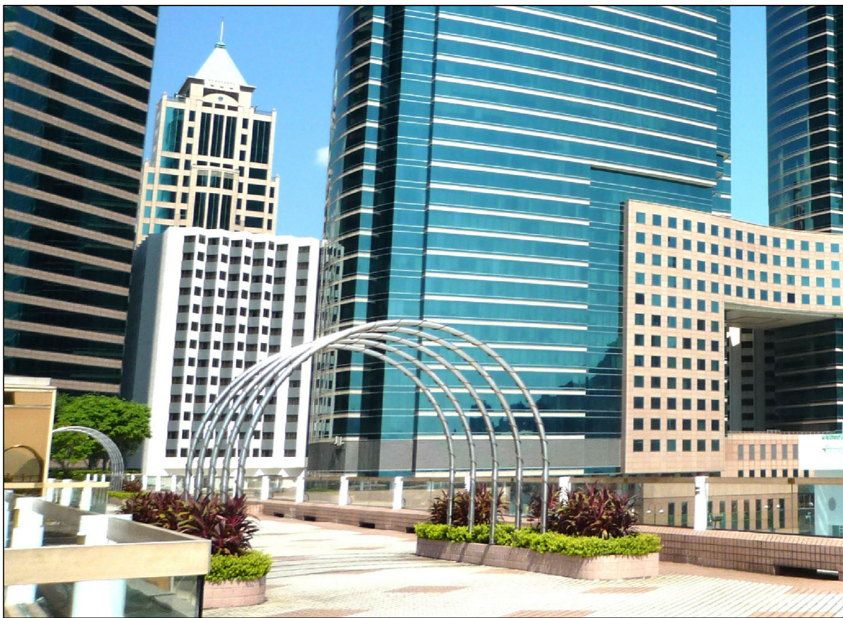
VSR 25 Hong Kong Hotel and Prince Hotel