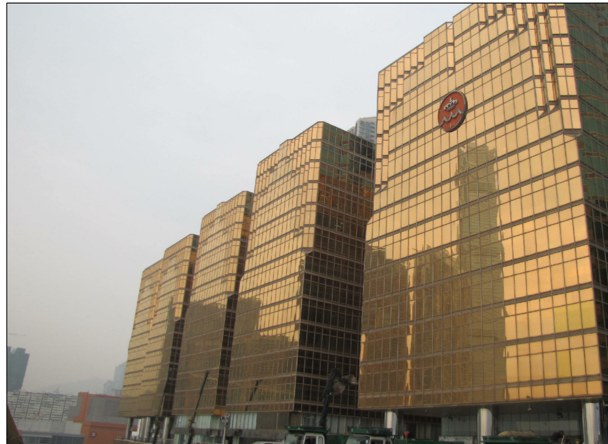
VSR 24 China Hong Kong City