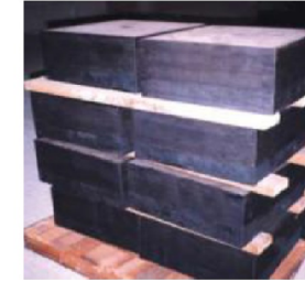
Neoprene or Natural Rubber Bearing