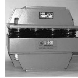
Spring Type Bearing

Isolation bearings: Spring or neoprene type subjected to designer requirement