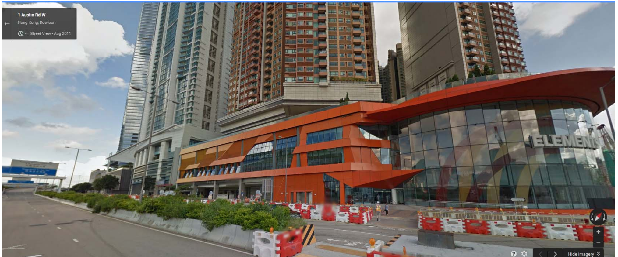
Figure 4) The Arch