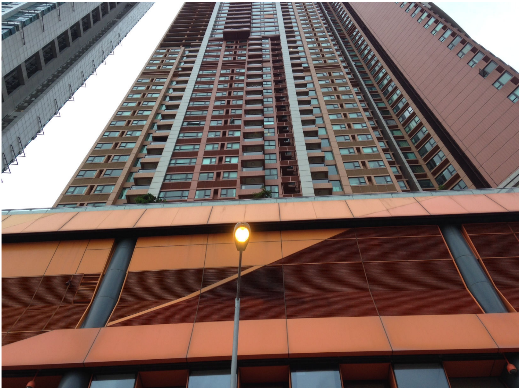
Figure 5) Facade of The Arch facing Austin Road